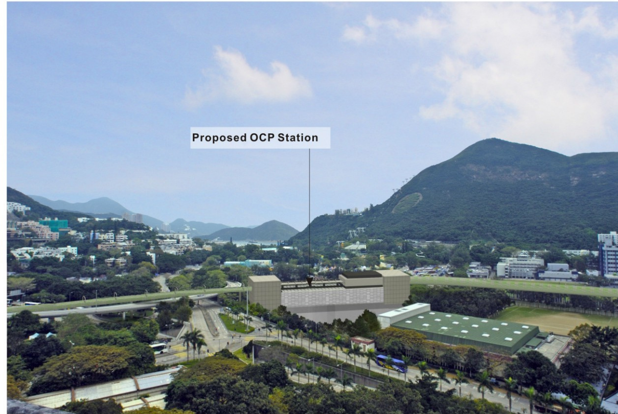
Day 1 of Operation Phase with landscape mitigation measures