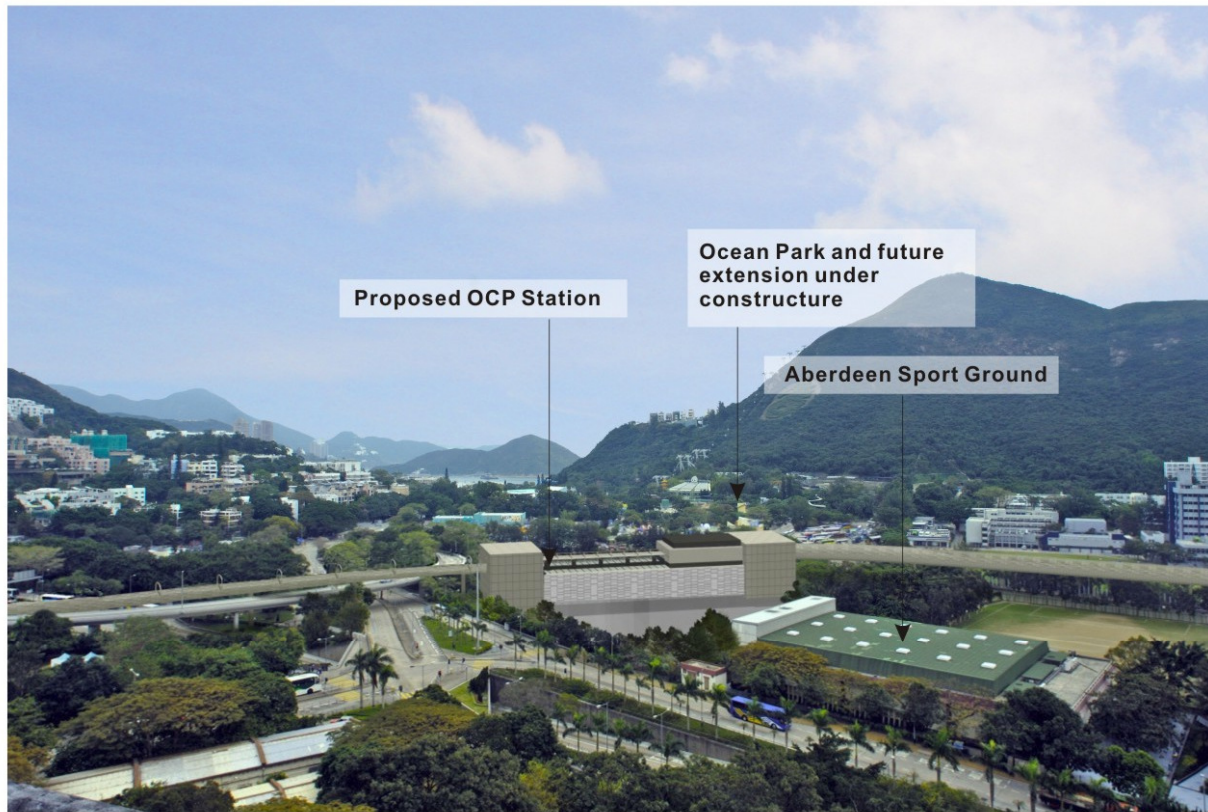
Day 1 of Operation Phase without landscape mitigation measures