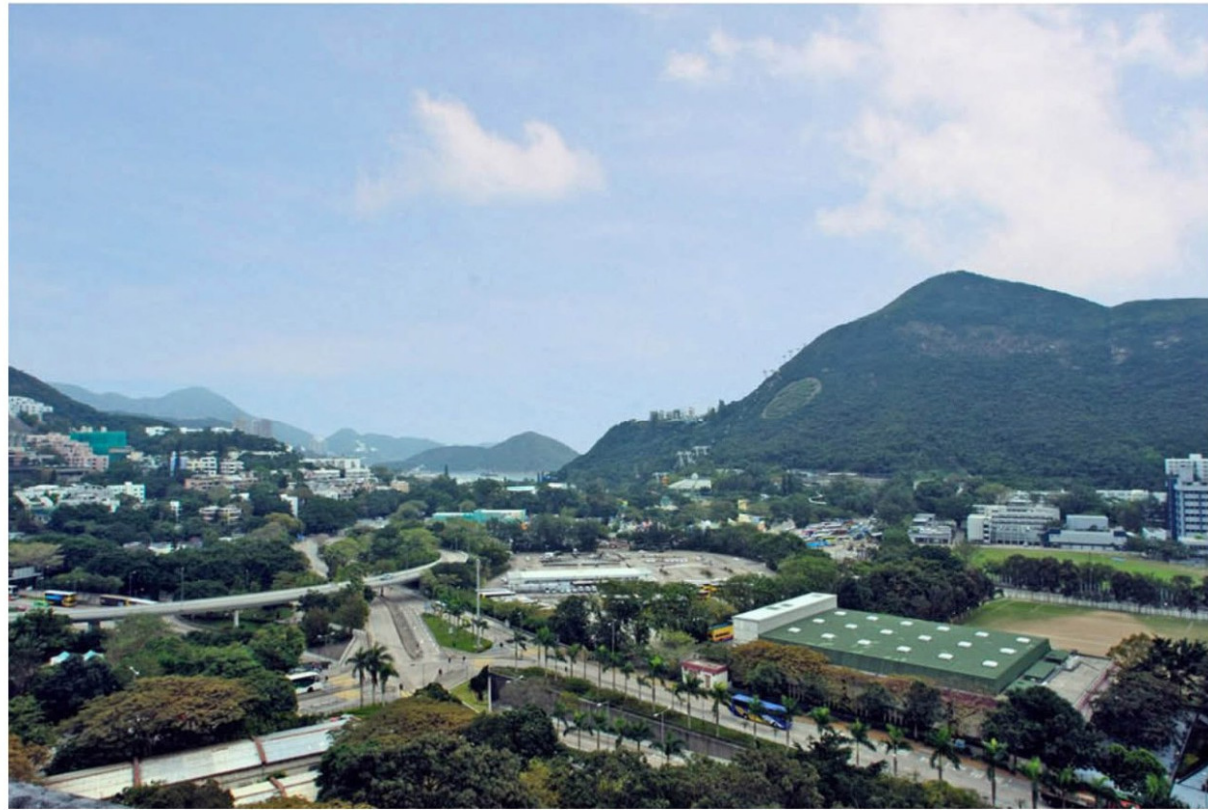
Existing Condition Vantage Point P - View south from the roof of Grantham Hospital looking towards the proposed OCP Station