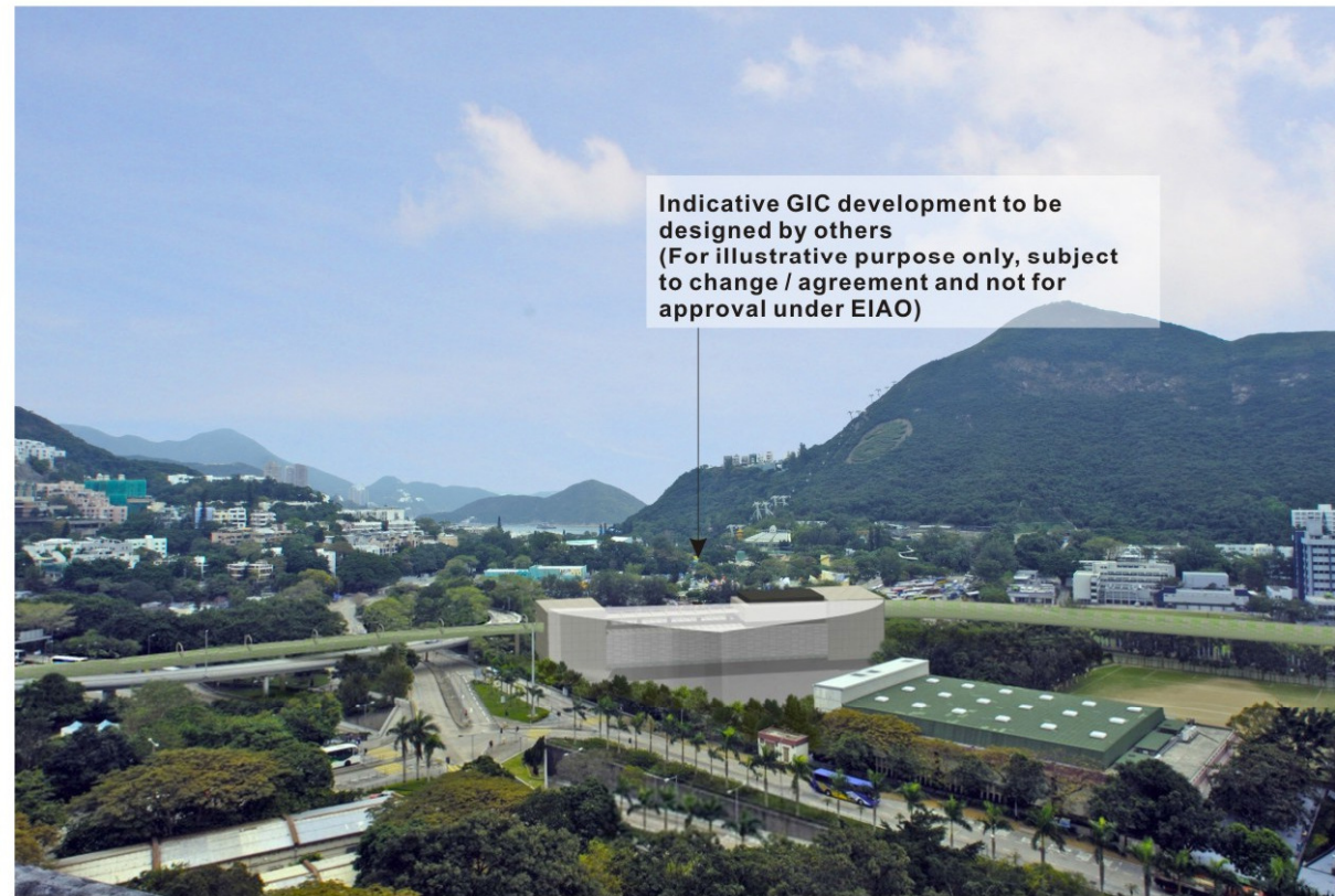
Year 10 of Operation Phase with landscape mitigation measures fully established