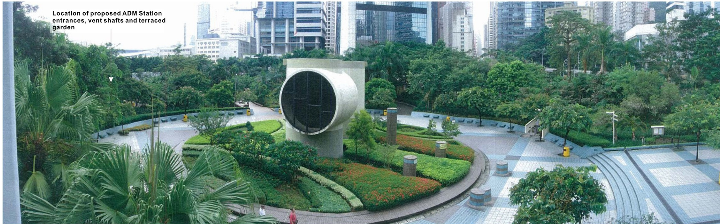
Location of proposed ADM Station entrances, vent shafts and terraced garden