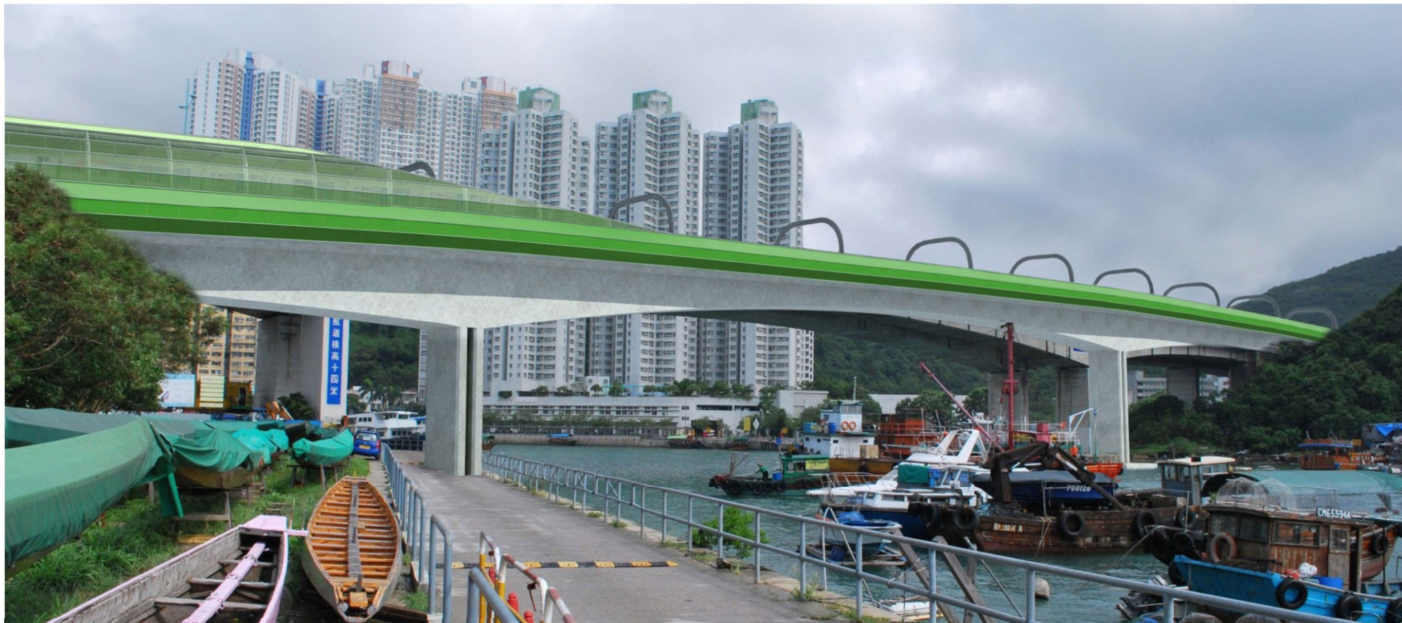
Year 10 of Operation Phase with landscape mitigation measures fully established