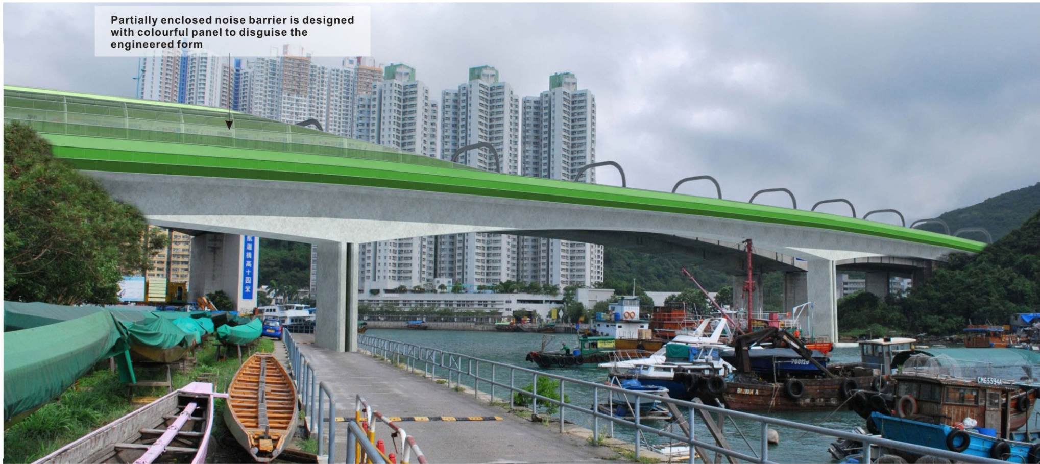
Day 1 of Operation Phase with landscape mitigation measures

Partially enclosed noise barrier is designed with colourful panel to disguise the engineered form