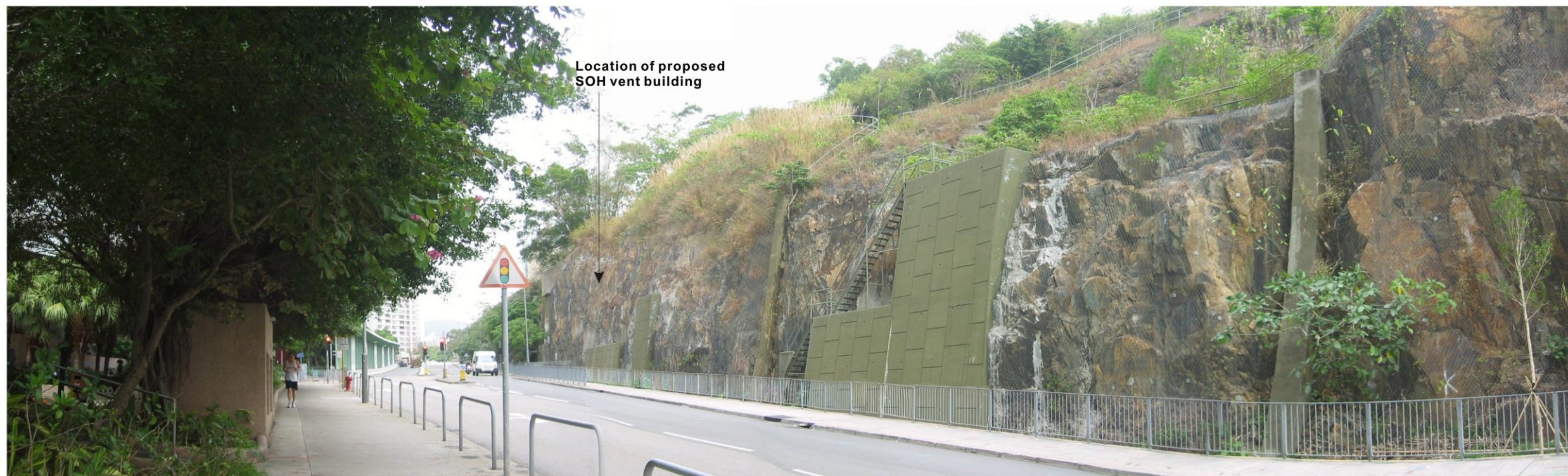
Existing Condition Vantage Point V - View north at street level from Lee Nam Road looking towards SOH Station Vent Building