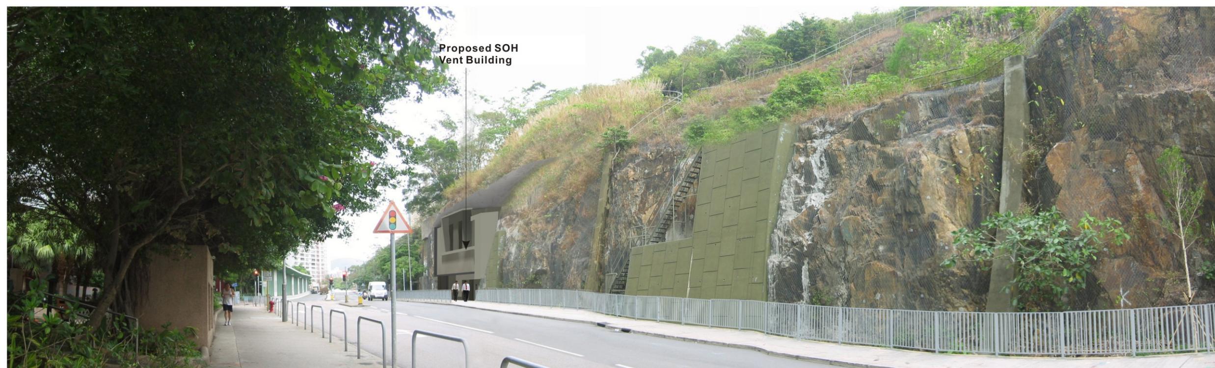
Day 1 of Operation Phase without landscape mitigation measures