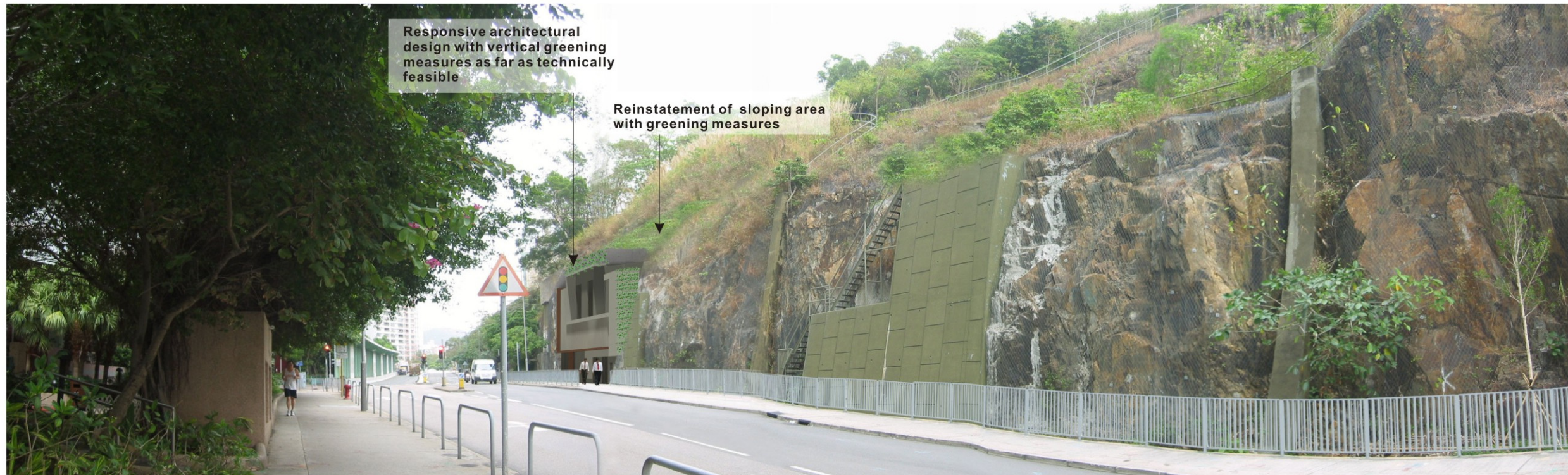
Day 1 of Operation Phase with landscape mitigation measures