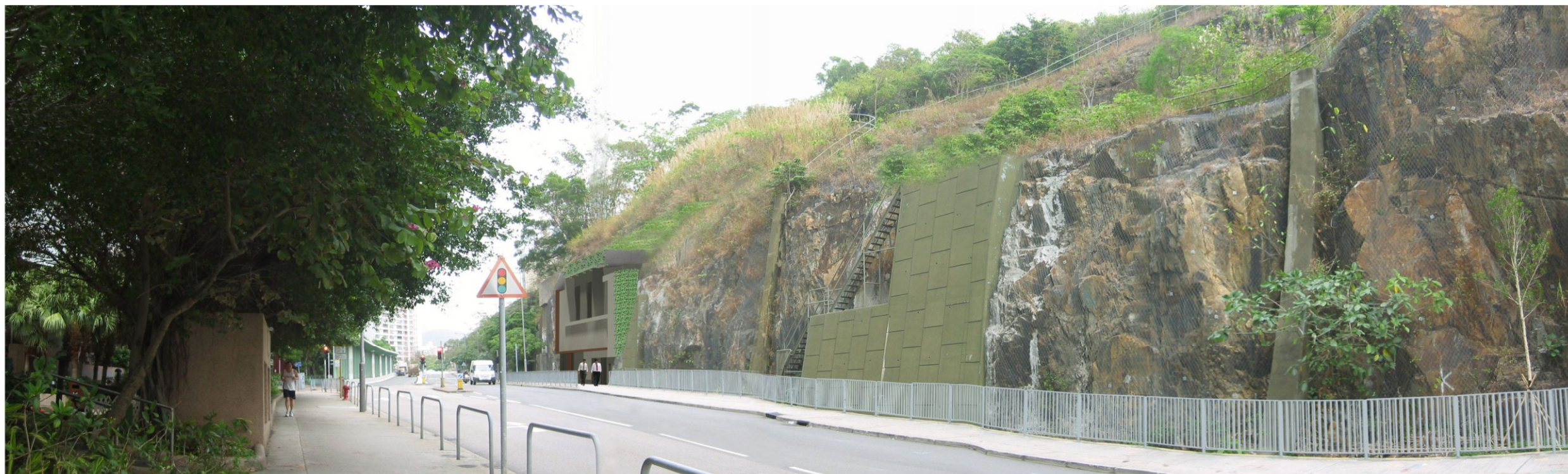
Year 10 of Operation Phase with landscape mitigation measures fully established