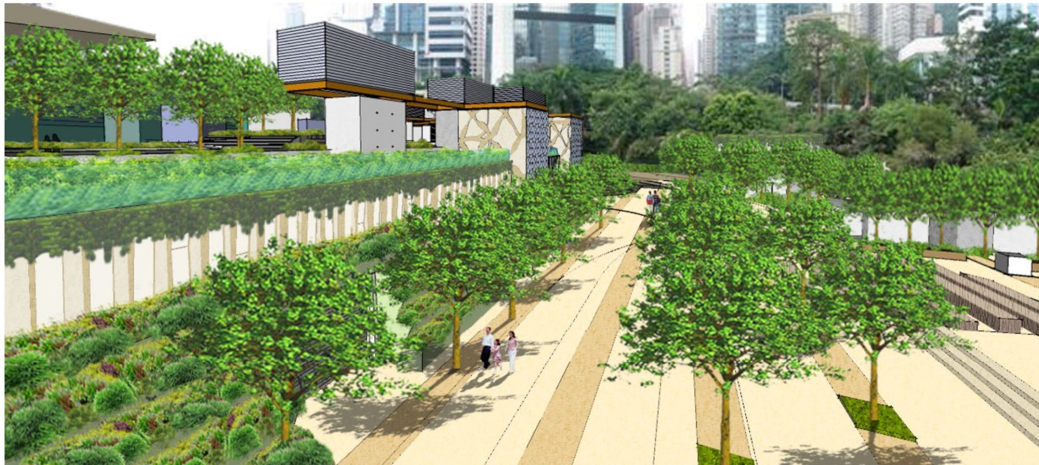
Year 10 of Operation Phase with landscape mitigation measures fully established