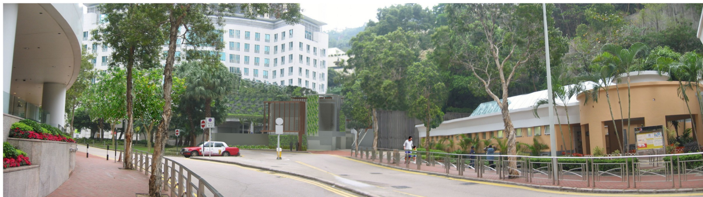
Year 10 of Operation Phase with landscape mitigation measures fully established