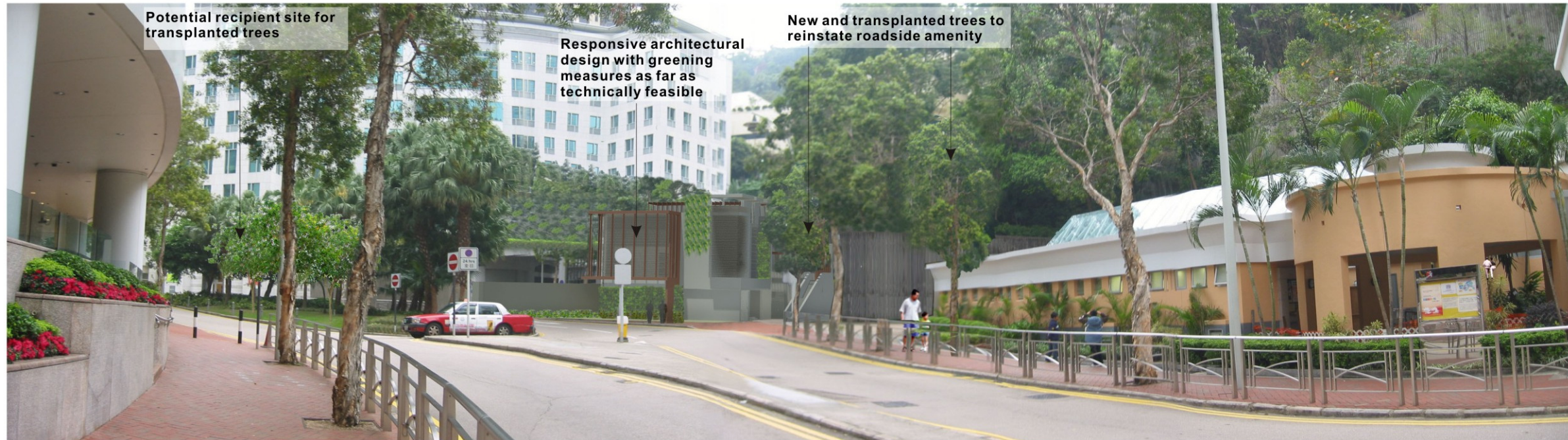
Day 1 of Operation Phase with landscape mitigation measures