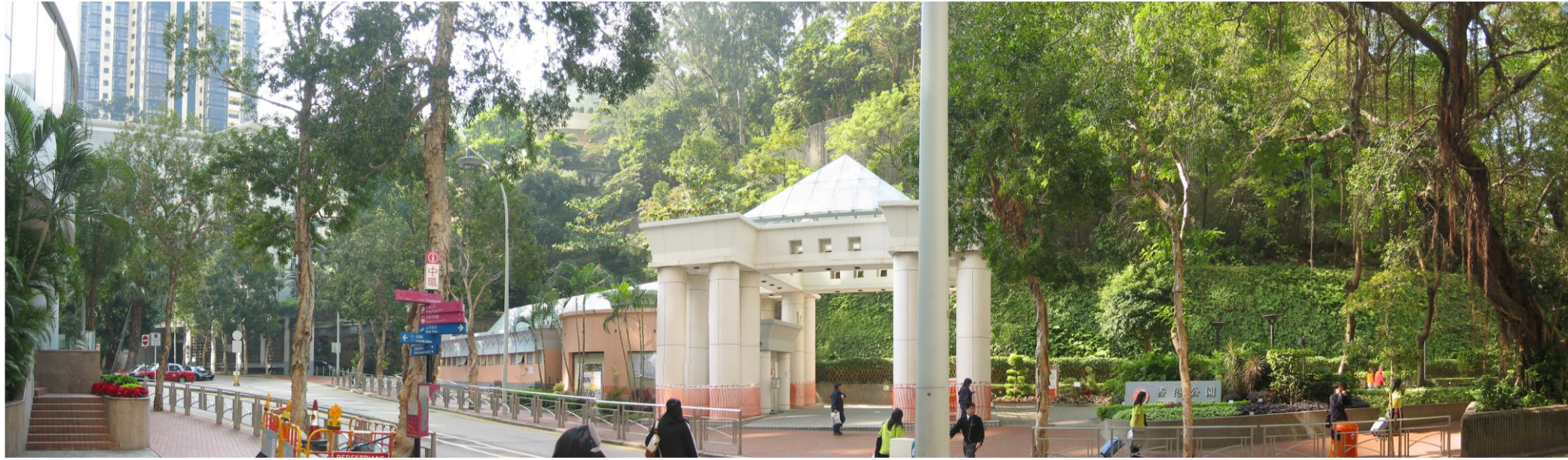
LCA 2 Hong Kong Park Recreational Landscape