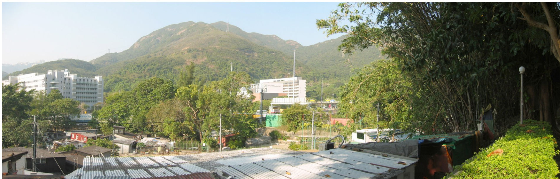
LCA 4 Aberdeen Country Park Landscape