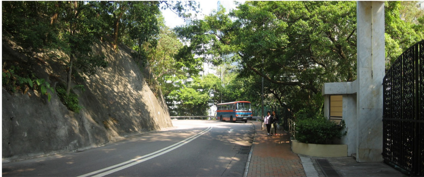
LCA 3 Mid-Level Upland Landscape