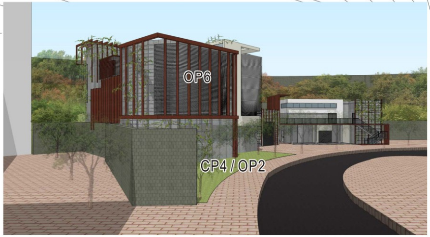
Proposed Vent Shaft at Hong Kong Park Entrance

NAM FUNG PORTAL TO ADM TUNNEL HONG KONG PARK-VENTILATION BUILDING LANDSCAPE LAYOUT PLAN © Mott MacDonald Hong Kong Limited