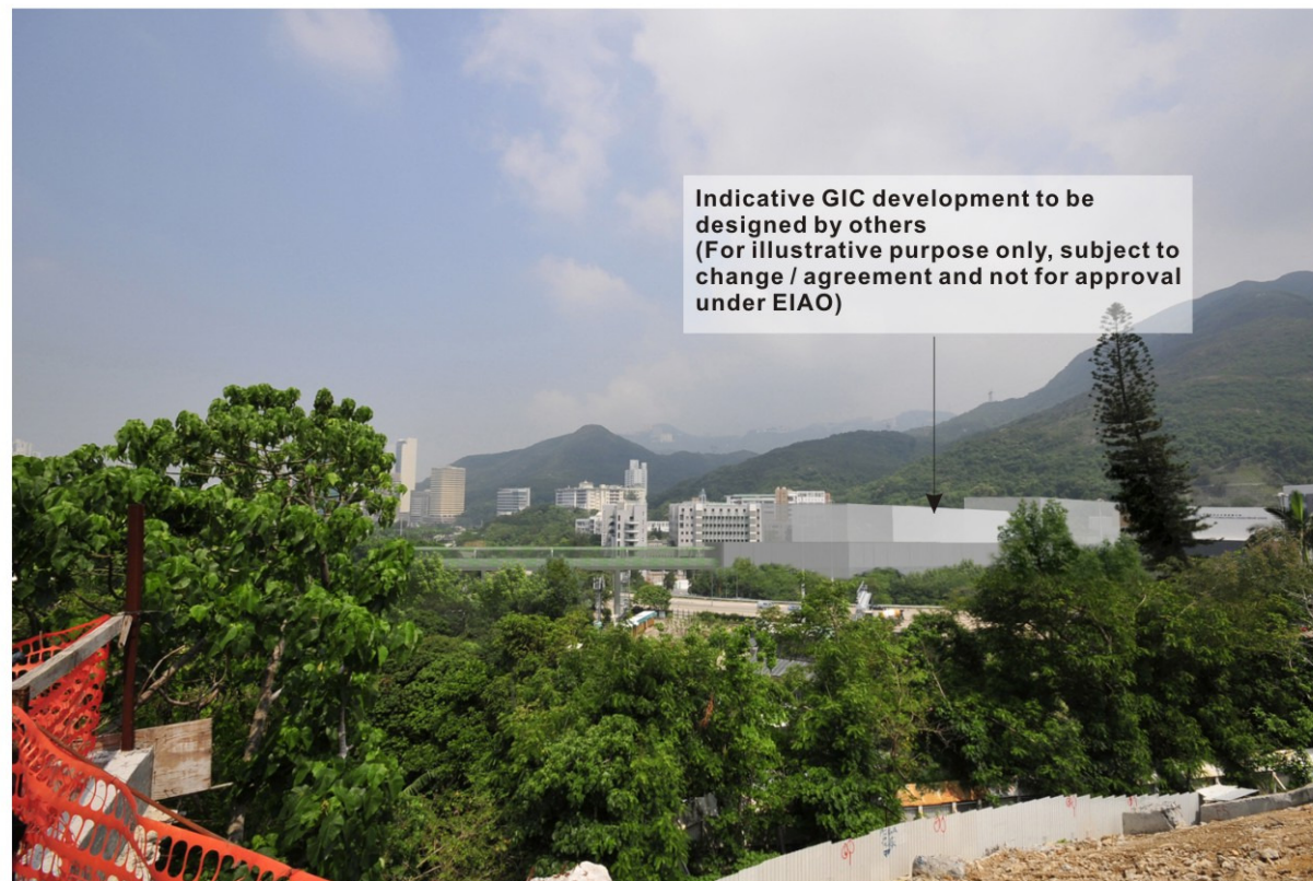
Year 10 of Operation Phase with landscape mitigation measures fully established