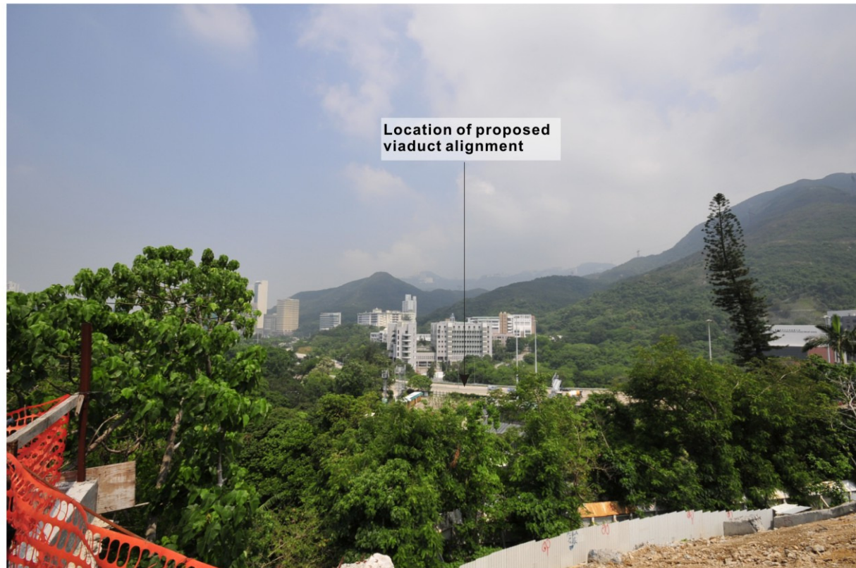
Existing Condition Vantage Point M - View northwest at an elevated level from a construction site at Shouson Hill looking towards the proposed viaduct from Nam Fung Portal to OCP station