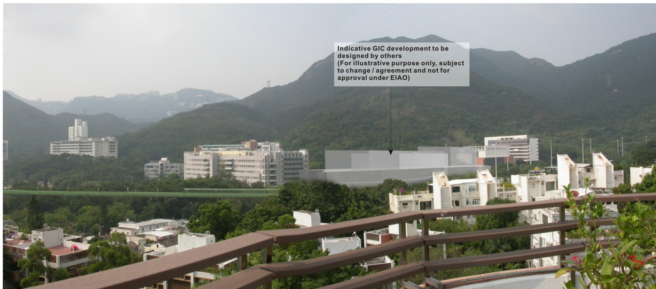
Year 10 of Operation Phase with landscape mitigation measures fully established