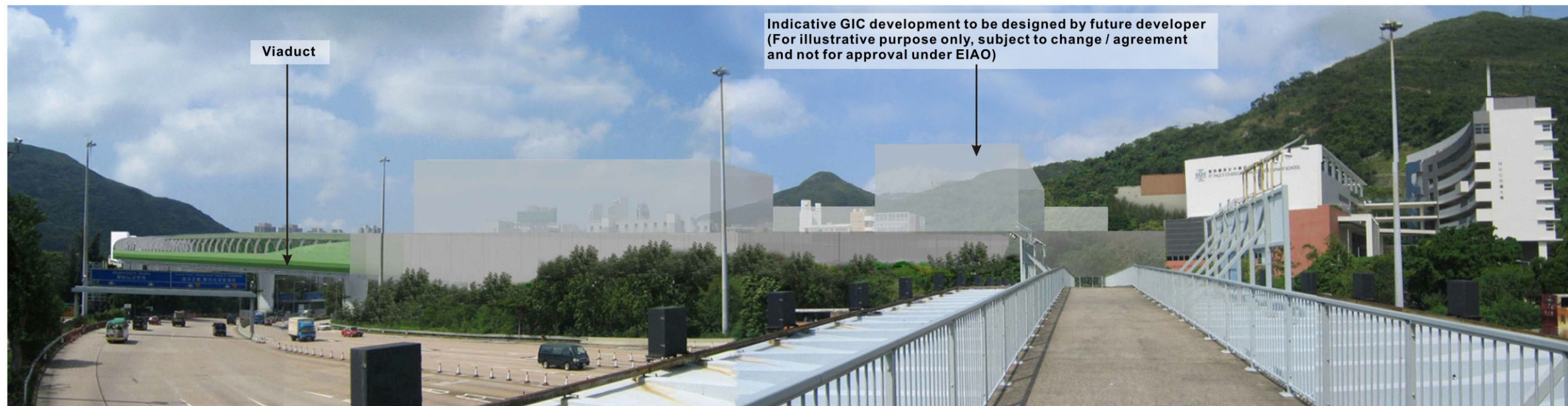
Year 10 of Operation Phase with landscape mitigation measures fully established