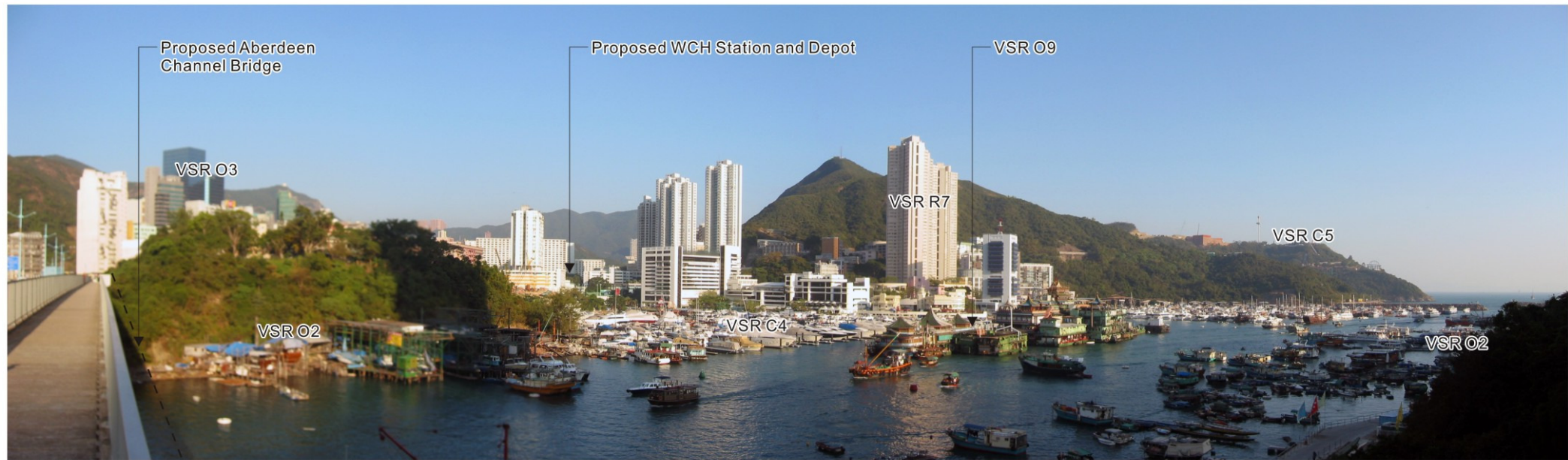
VSR R7 Residents of estates in Wong Chuk Hang_02