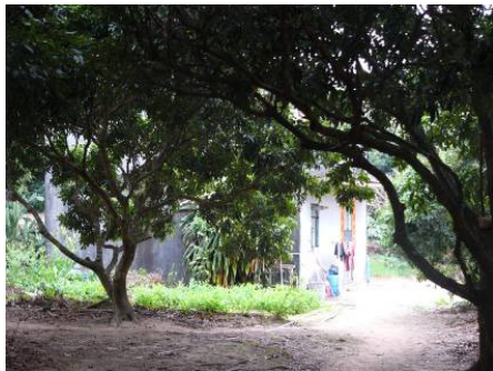
Kan Tau Wai – KTW3