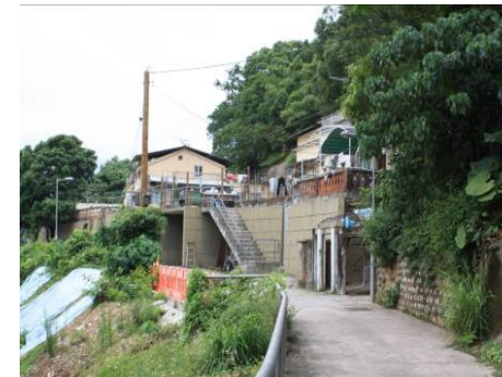
Nam Wa Po – NWP1