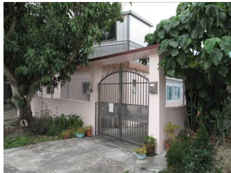
Kiu Tau – KT2