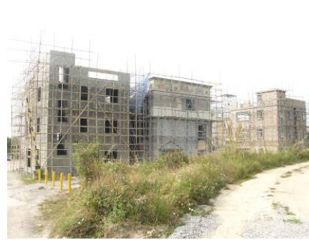
Ping Yeung – PY7