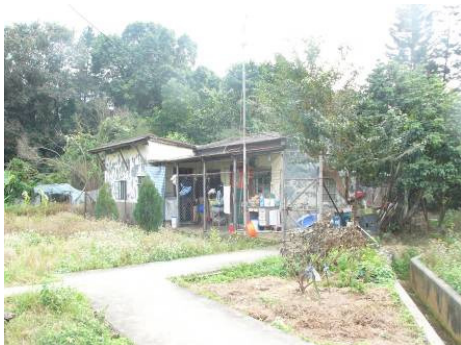
Kiu Tau – KT1