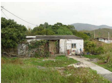
Ping Yeung – PY5