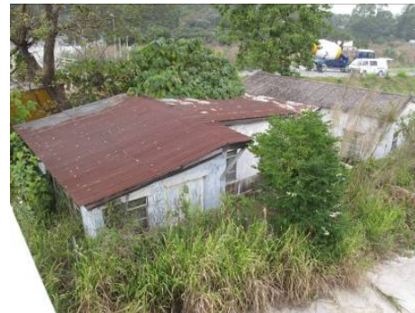
Kiu Tau – KT3