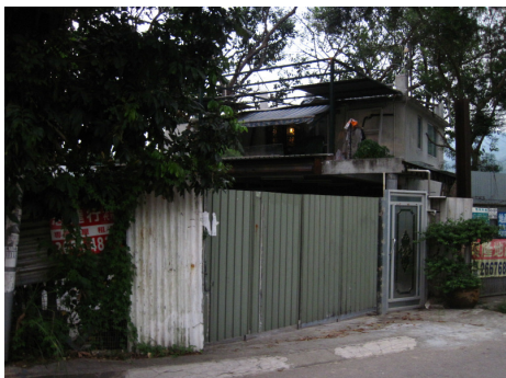
Nam Wa Po – NWP2