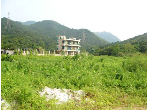
Loi Tung – LT4