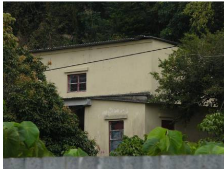
Po Kak Tsai – PKT3