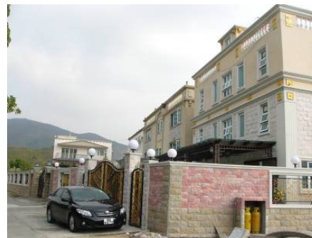
Ping Yeung – PY3