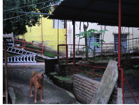
Shan Tong – ST1