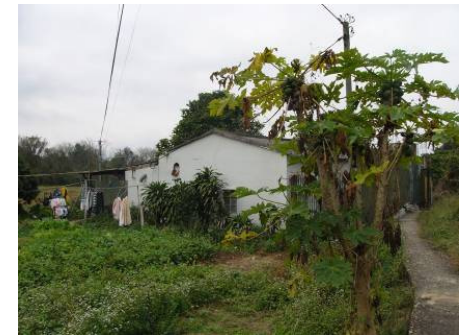
Kan Tau Wai – KTW2