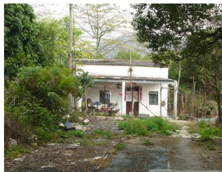
Ping Yeung – PY6