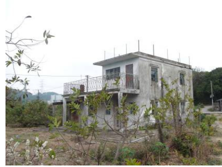
Chuk Yuen – V2