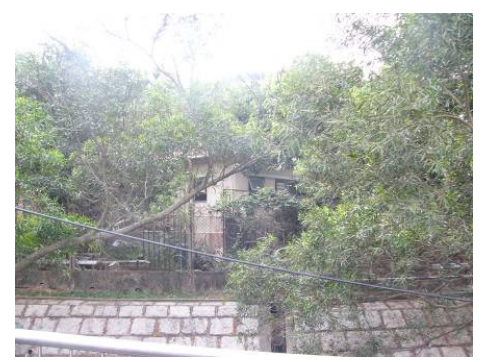
Wo Hop Shek – WHS1