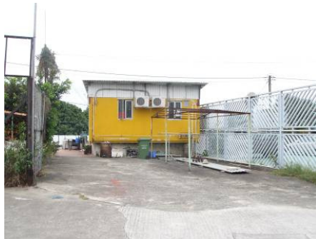
Ta Kwu Ling – TKL2