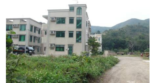
Tai Tong Wu – TTW1