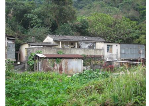
Po Kak Tsai – PKT1