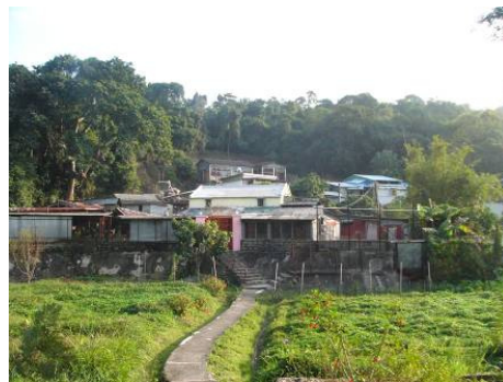
Loi Tung – LT1