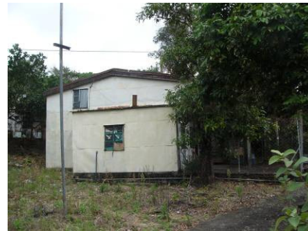
Kan Tau Wai – KTW5