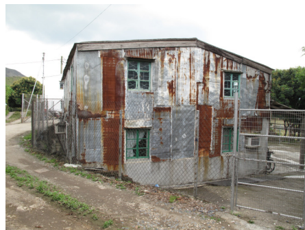
Ping Yeung – PY1, PY2