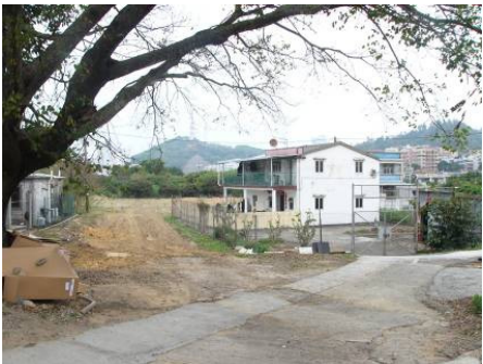
Ta Kwu Ling – TKL1