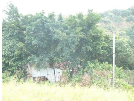
Kan Tau Wai – KTW4