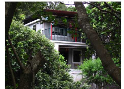
Loi Tung – LT3