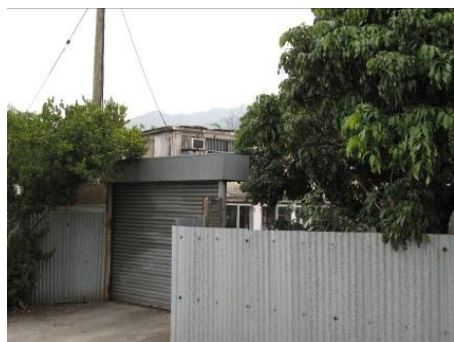
Kau Lung Hang San Wai - KLHSW