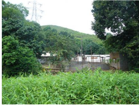
Leng Pei Tsuen – LPT