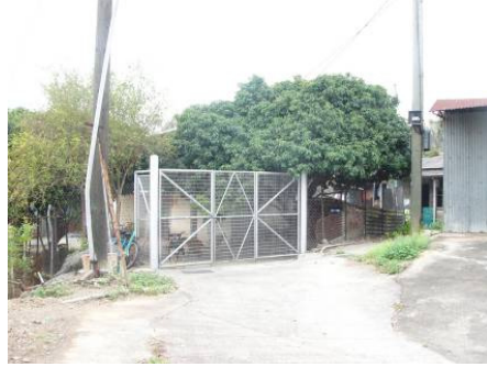
Chuk Yuen – V1