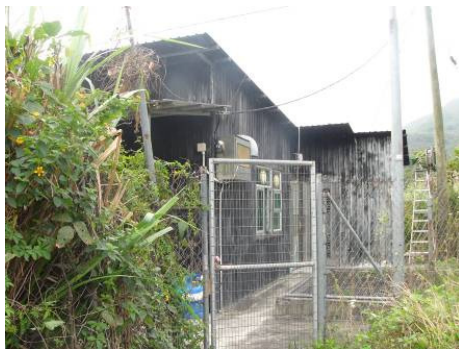
Tai Tong Wu – TTW2