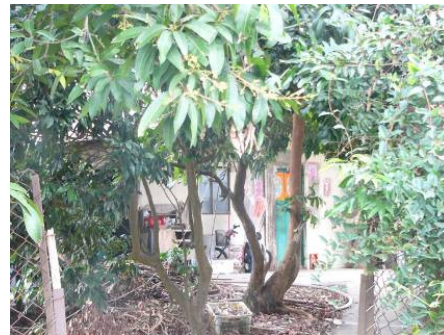
Kan Tau Wai – KTW1