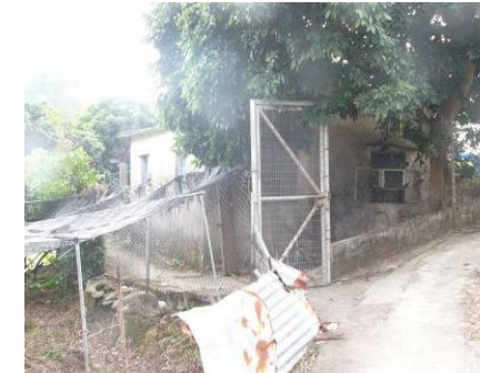
Ping Yeung – PY4