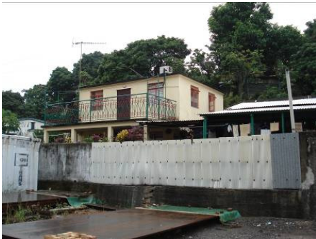
Po Kak Tsai – PKT2