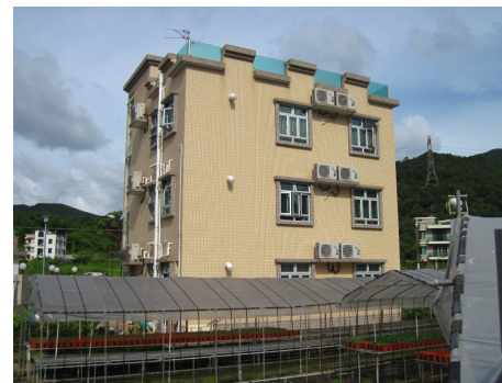
Loi Tung – LT2