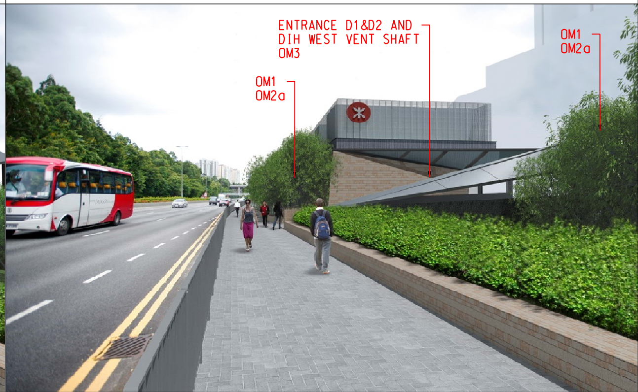
YEAR 10 WITH MITIGATION

REMARKS: THE DRAWINGS PROVIDE ONLY AESTHETIC IMPRESSION OF THE INDICATIVE FORM, SIZE AND QUALITY OF THE ARCHITECTURAL AND LANDSCAPING TREATMENT FOR THE STRUCTURES. THE FINAL DETAILS OF LAYOUT, MATERIALS, FINISHES WILL BE SUBJECT TO DETAILED DESIGN.