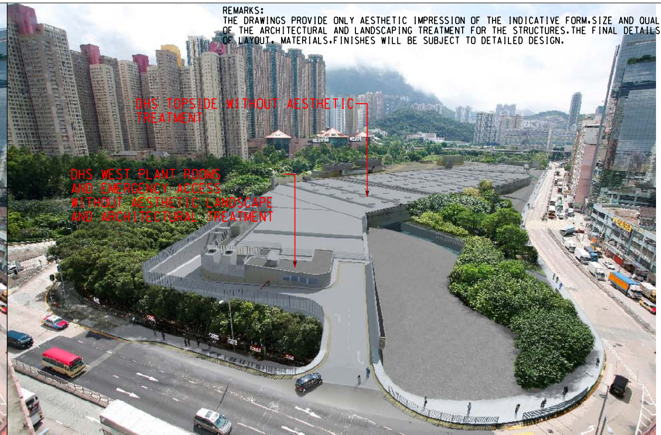
DAY 1 WITHOUT MITIGATION

REMARKS: THE DRAWINGS PROVIDE ONLY AESTHETIC IMPRESSION OF THE INDICATIVE FORM, SIZE AND QUALITY OF THE ARCHITECTURAL AND LANDSCAPING TREATMENT FOR THE STRUCTURES. THE FINAL DETAILS OF LAYOUT, MATERIALS, FINISHES WILL BE SUBJECT TO DETAILED DESIGN.