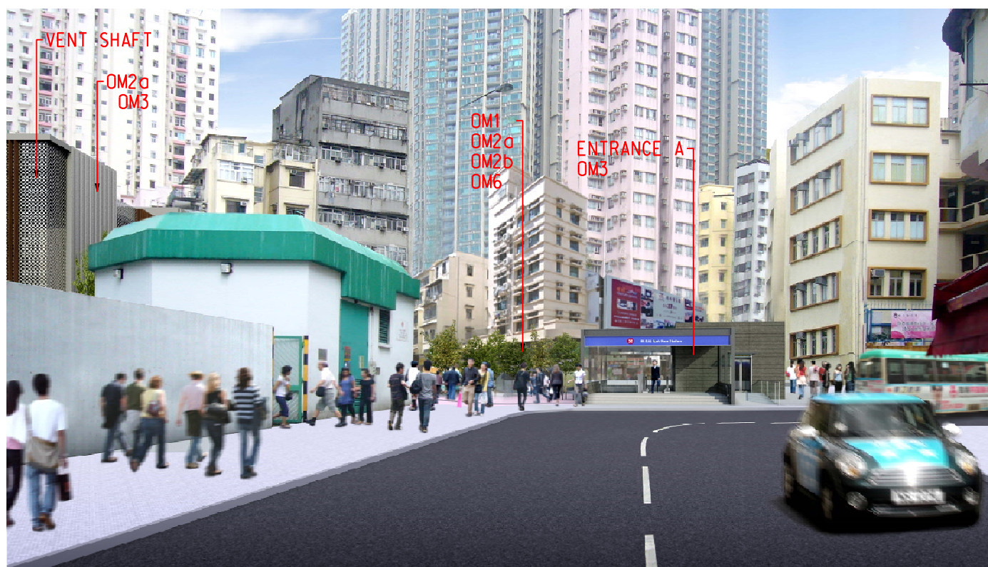
DAY 1 WITH MITIGATION