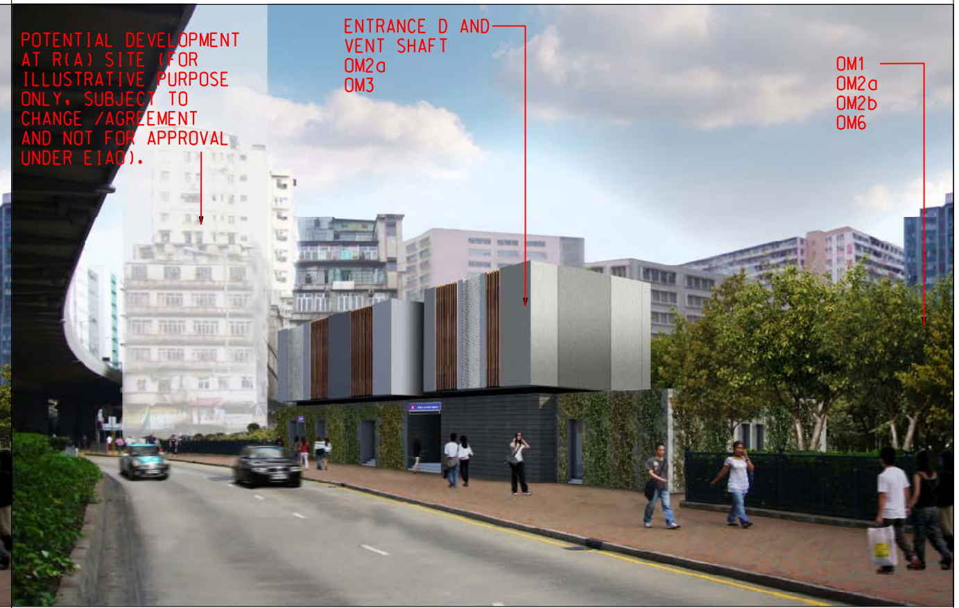
YEAR 10 WITH MITIGATION

K:\Microstation Standard\Printer Driver\A3_COLOUR.dwt Default PRINTED BY: Techin Central Link NEW DRAWING FIGURE-6.11.34.dgn FILENAME: K:\MK Project\047_Shatin_Central Link_NEW DRAWING FIGURE-6.11.34.dgn PLOT DRW: K:\Microstation Standard\Printer Driver\A3_COLOUR.dwt MODELNAME: 2011/7/8 DATE: 2011/7/8