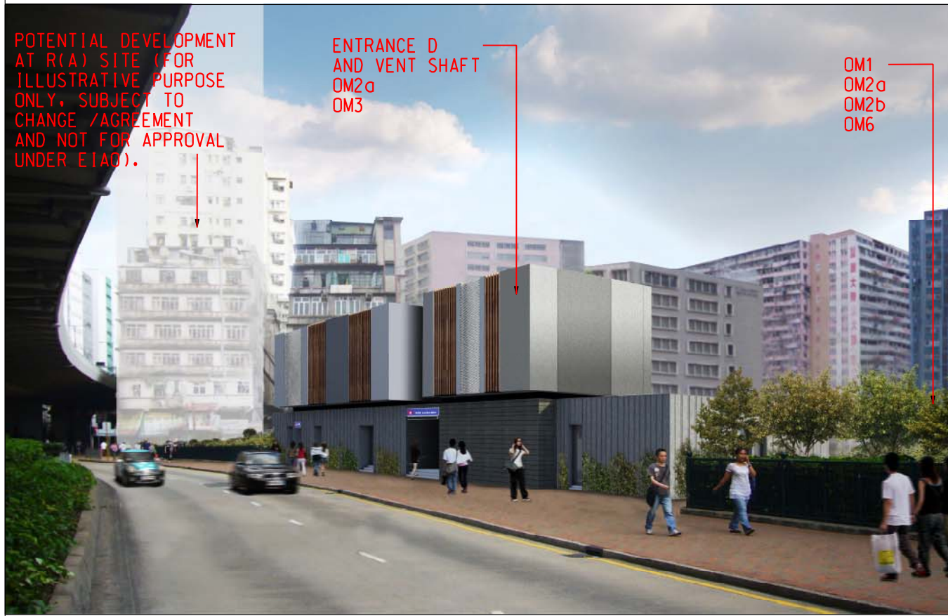
DAY 1 WITH MITIGATION