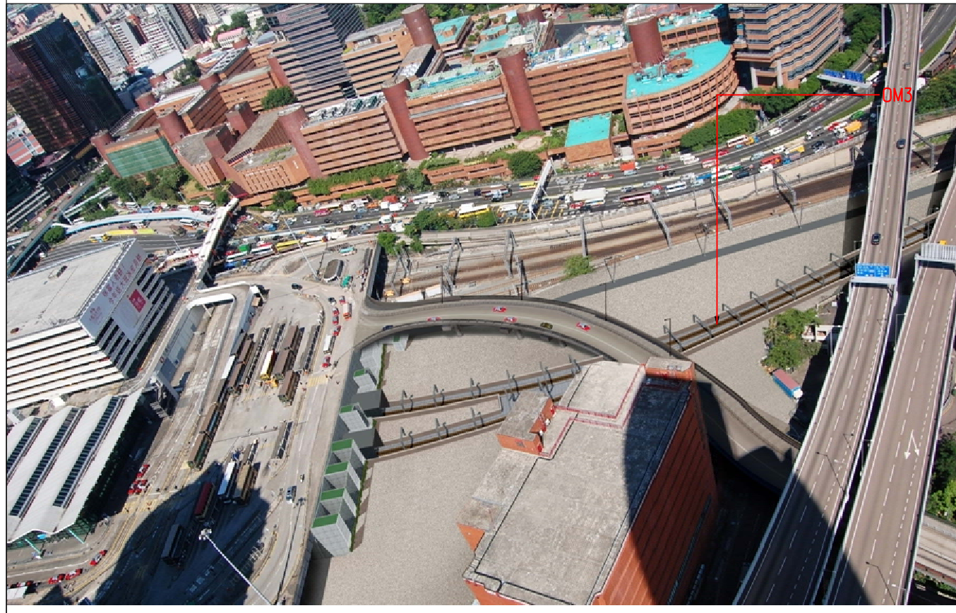
DAY 1 WITH MITIGATION