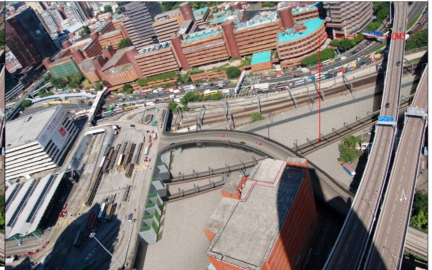
YEAR 10 WITH MITIGATION

PLOT DRW: K:\Microstation Standard\Printer Driver\A3 COLOUR.ppt MODELNAME: Default PRINTED BY: designer3 2010/11/3 10:43:44 053357 FILENAME: K:\Project\HK PROJ\047 Shatin CentralLink\NEW DRAWING\FIGURE-6.11.35A.dgn