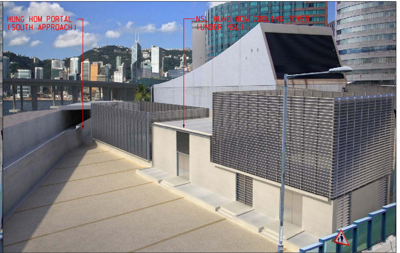
DAY 1 WITHOUT MITIGATION