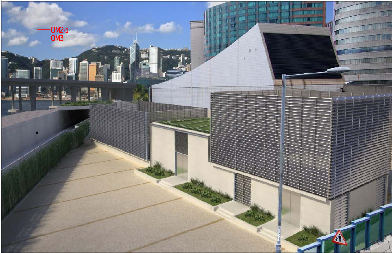
DAY 1 WITH MITIGATION