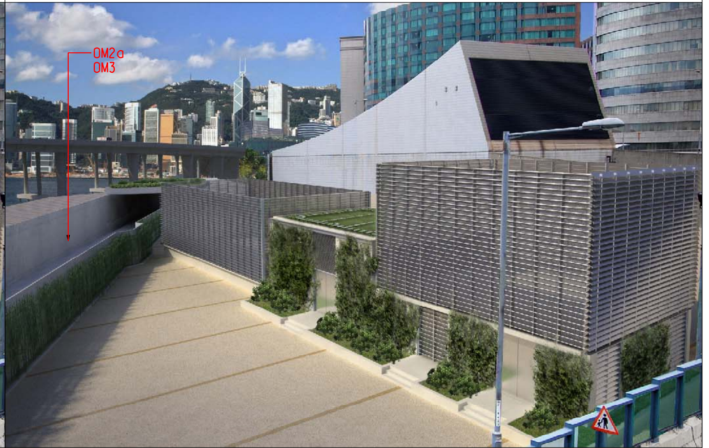
YEAR 10 WITH MITIGATION

PLOT DRW: K:\Microstation Standard\Printer Driver\A3_COLOUR.plt MODELNAME: Default PRINTED BY: designer3 2011/2/8 10:40:44 FILENAME: K:\Project\HK PROJ\0A7 Shatin Central\LINK DRAWING\FIGURE-6.11.36.dgn