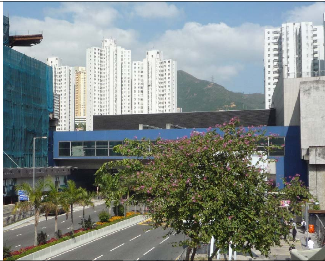
PM1 - EXISTING VIEW

REMARKS: THE DRAWINGS PROVIDE ONLY AESTHETIC IMPRESSION OF THE INDICATIVE FORM, SIZE AND QUALITY OF THE ARCHITECTURAL AND LANDSCAPING TREATMENT FOR THE STRUCTURES. THE FINAL DETAILS OF LAYOUT, MATERIALS, FINISHES WILL BE SUBJECT TO DETAILED DESIGN.