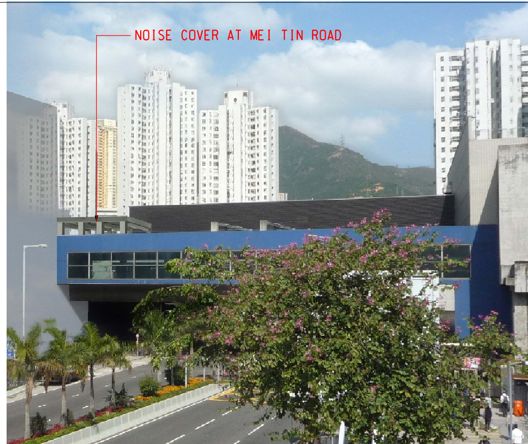
PM1 - PHOTOMONTAGE (WITHOUT AESTHETIC TREATMENT)

REMARKS: THE DRAWINGS PROVIDE ONLY AESTHETIC IMPRESSION OF THE INDICATIVE FORM, SIZE AND QUALITY OF THE ARCHITECTURAL AND LANDSCAPING TREATMENT FOR THE STRUCTURES. THE FINAL DETAILS OF LAYOUT, MATERIALS, FINISHES WILL BE SUBJECT TO DETAILED DESIGN.