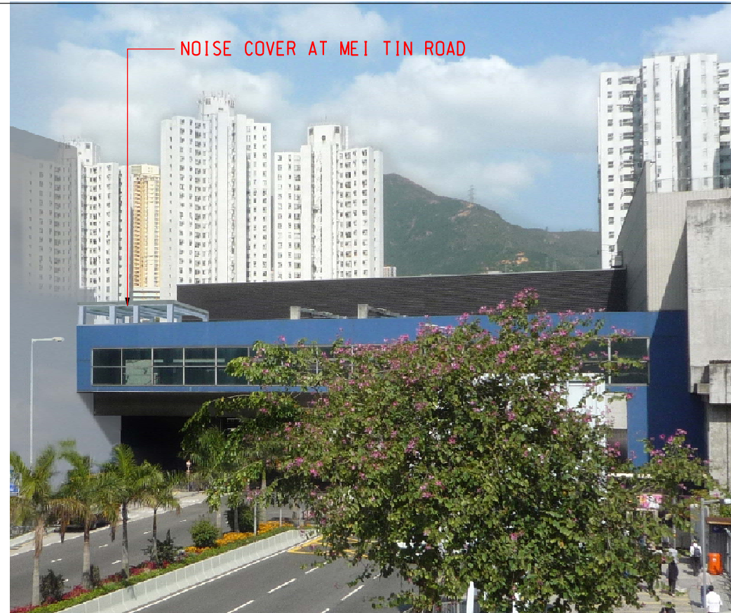
PM2 - PHOTOMONTAGE (WITH AESTHETIC TREATMENT)

K:\Microstation Standard\Printer Driver\A3 COLOUR.plt MODELNAME: Default PRINTED BY: pchoni 2011/4/3 10:09:06 FILENAME: K:\Project\HK PROJ\047 Shatin Central Link\NEW DRAWING\FIGURE-6.11.43A.dgn