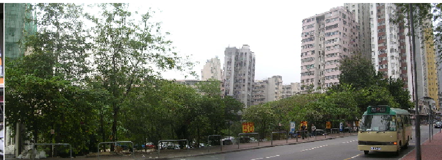
MTW/LR3.3 - TREES IN PAKING LOT AT SHAN XI STREET