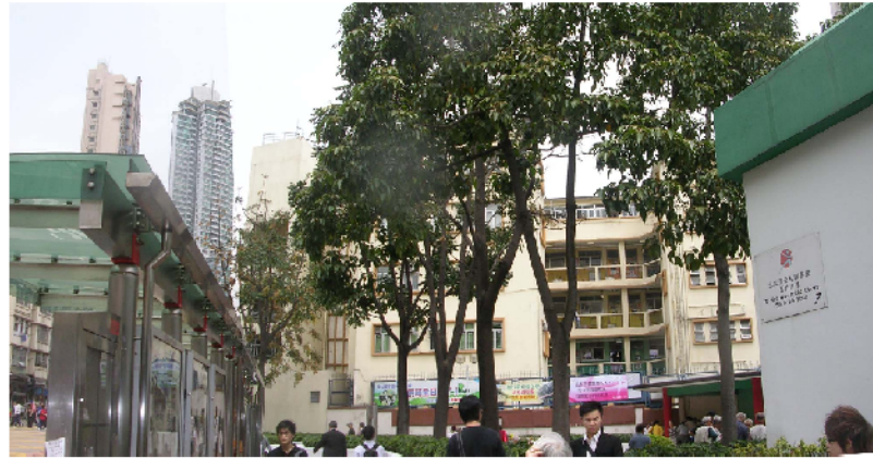
MTW/LR1.1 - LOK SHAN ROAD PLAYGROUND