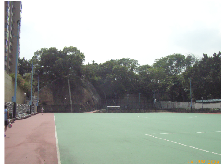
MTW/LR1.5 - MA TAU WAI ROAD PLAYGROUND