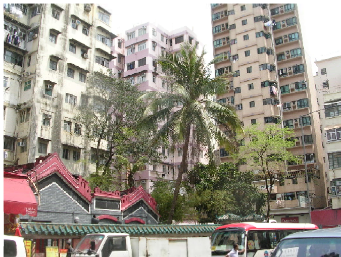
MTW/LR2.1 - TREES IN TIN HUA TEMPLE