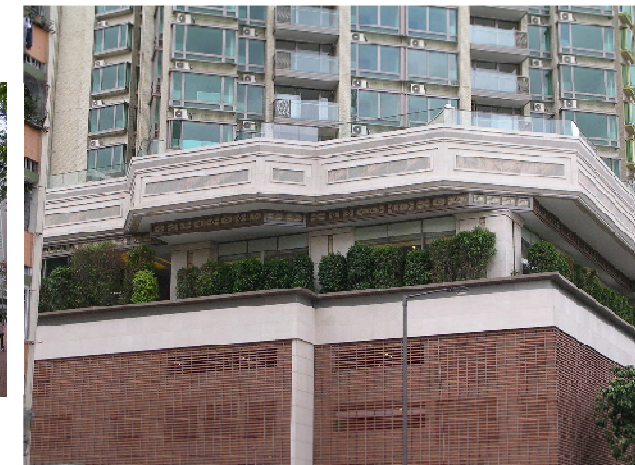
MTW/LR6.2 - TREES IN CELESTIAL HEIGHT

K:\Microstation_Standard\Printer_Driver\A3_COLOUR.plt MODELNAME: 2011/2/1 %s\%e 1042402 FILENAME: K:\Project\HK PROJ\017 Shatin Central Link\NEW DRAWING\FIGURE-6.43C.dgn