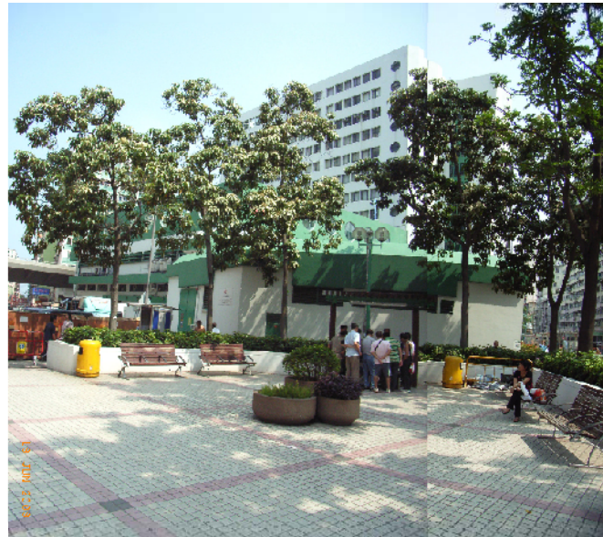
MTW/LR1.2 - TO KWA WAN COMPLEX PLAYGROUND