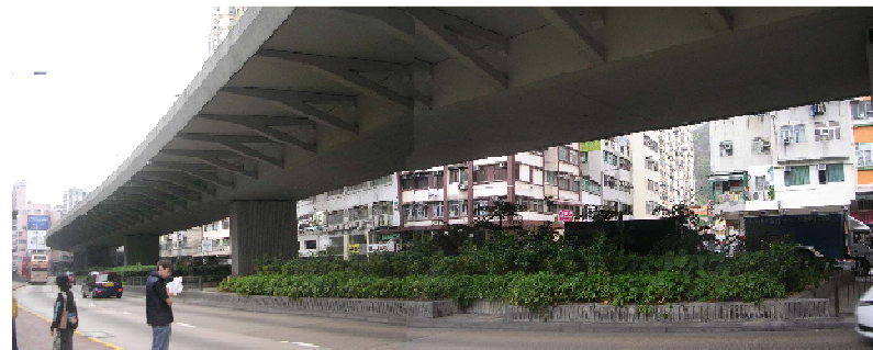
MTW/LR3.2 - VEGETATION ALONG KOWLOON CITY ROAD