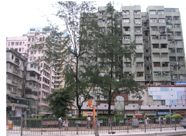
MTW/LR1.6 - SITTING OUT AREA AT JUNCTION OF MA TAU WAI ROAD AND TAM KUNG ROAD