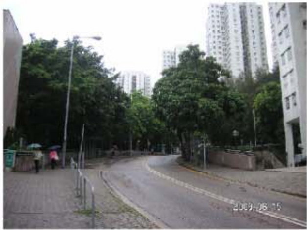
MCH/LR - 6.3 - TREES IN CHUK YUEN PLAZA/TSUI CHUK GARDEN