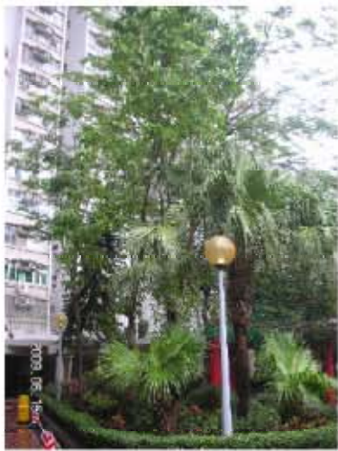
MCH/LR - 6.2 - TREES IN PANG CHING COURT