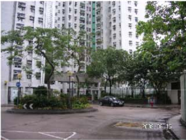
MCH/LR - 6.4 - TREES IN TIN WANG COURT