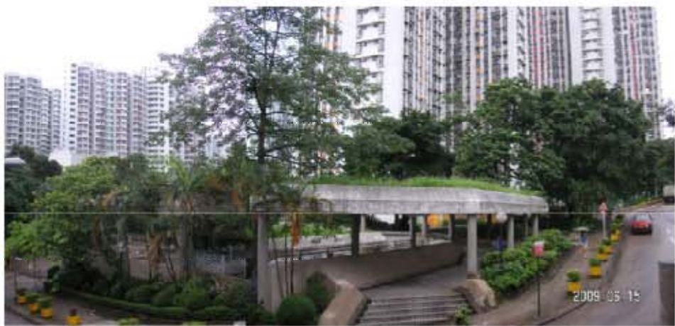
MCH/LR - 6.5 - TREES IN TIN MA COURT