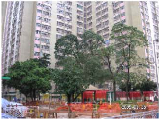
MCH/LR - 6.1 - TREES IN WESTERN CHUK YUEN SOUTH ESTATE