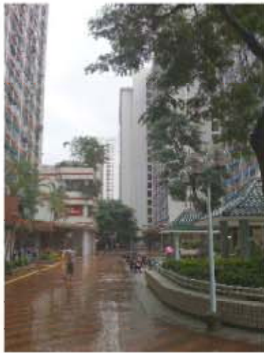
MCH/LR - 6.6 - TREES IN CHUK YUEN SOUTH ESTATE AND SOUTHERN CHUK YUEN SOUTH ESTATE PODIUM