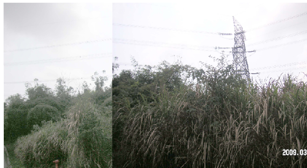
HIK - LR 5.4 - WOODLAND AT TEI LUNG HAU