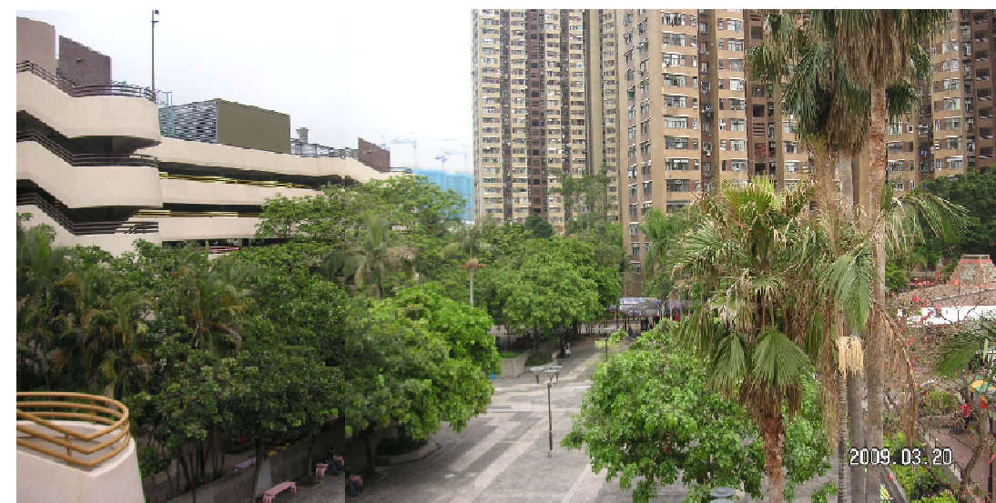
HIK - LR 6.2 - TREES IN HIN KENG ESTATE NORTH

MTR PROJECT: SHATIN TO CENTRAL LINK DRAWING NO.: NEX 2206 - TAW TO HUH SECTION FILE NAME: ...PROJ\OA7\FIGURE-6.4.3.dgn PRINTED BY: PCHANI DATE: 2010/5/4 16:01:46