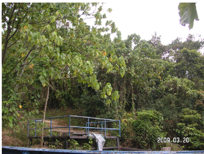
HIK - LR 5.3 - TREES ON SLOPES ADJACENT TO SHATIN WATER TREATMENT WORKS