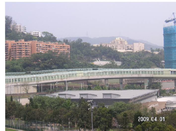
HIK - LR 5.5 - WOODLAND AT LOWER SHATIN HEIGHTS