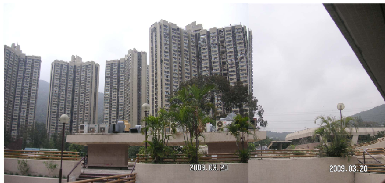
HIK - LR 6.1 - PODIUM DECK AT HIN KENG SHOPPING MALL