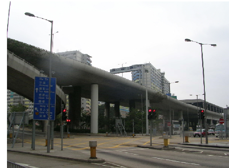
DIH & KAT - LR 6.6 - TREES IN CHOI HUNG ESTATE

K:\Microstation Standard\Printer_Driver\A3_COLOUR.dwt Default PRINTED BY: designer3 2011/2/10 K:\Project\HK PROJ\047 Shatin Central Link\NEW DRAWING\FIGURE-6.4.8C.dgn