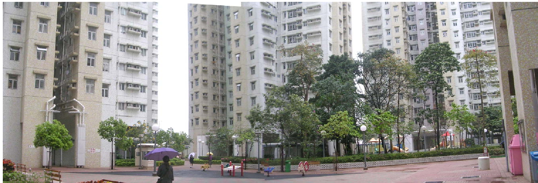
DIH & KAT - LR 6.5 - TREES IN RHYTHM GARDEN