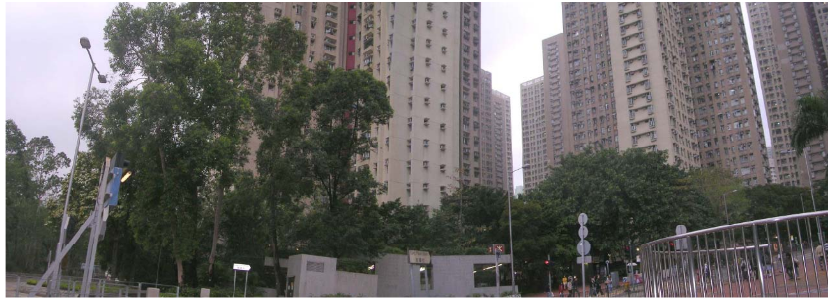
DIH & KAT - LR 6.3 - TREES IN LUNG POON COURT