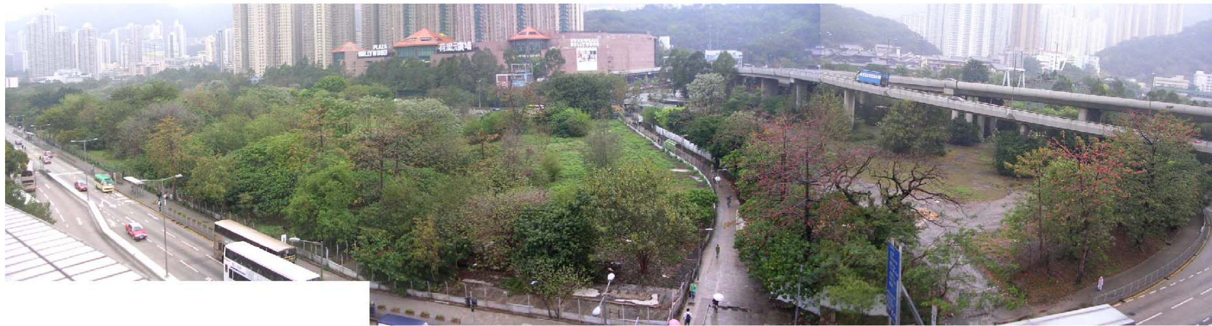
DIH & KAT - LR 9.1 - TREES IN DIAMOND HILL CDA SITE

K:\Microstation Standard\Printer Driver\A3 COLOUR.dpt MODELNAME: Default FILENAME: K:\Project\HK PROJ\047 Shatin CentralLink\NEW DRAWING\FIGURE-6.4.9A.dgn PRINTED BY: designer3 2010/11/9 10:03:44 0306:25