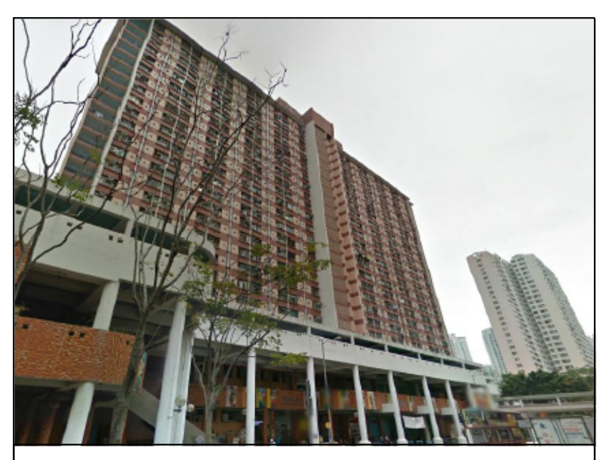
R1.13 TSUI PING NORTH ESTATE