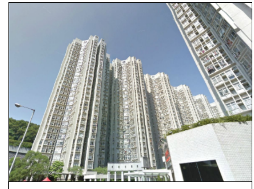
R1.17 SCENEWAY GARDEN