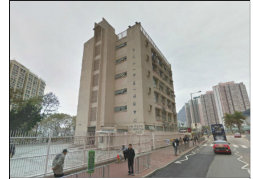
R1.16 RESIDENTIAL DEVELOPMENTS ALONG HIU KWONG STREET