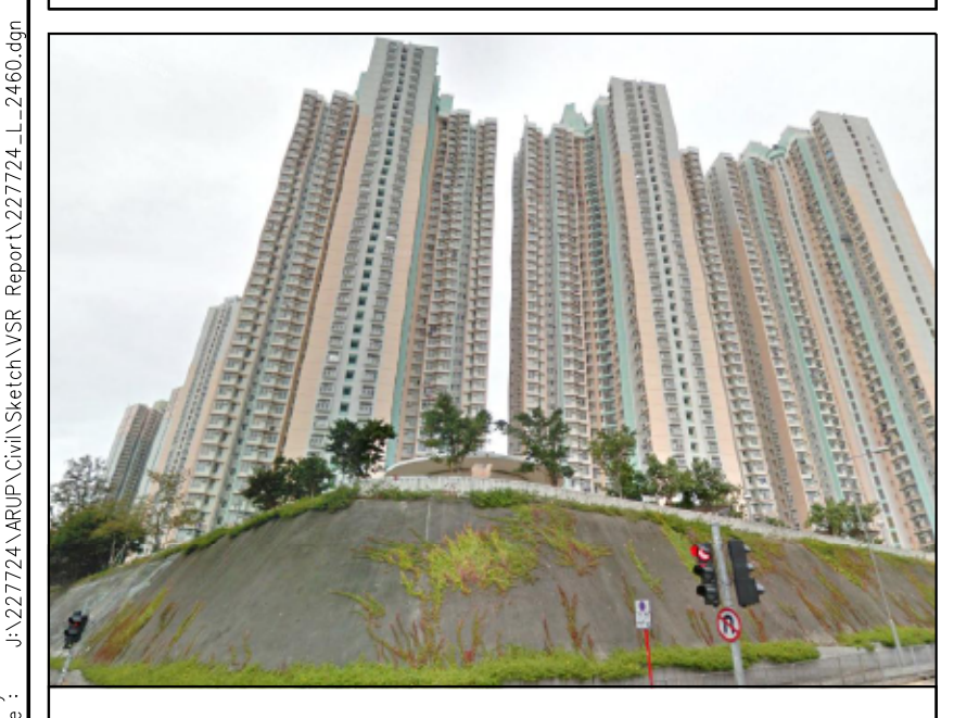
R1.12 SAU MAU PING SOUTH ESTATE