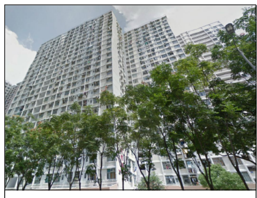
R1.14 TSUI PING SOUTH ESTATE