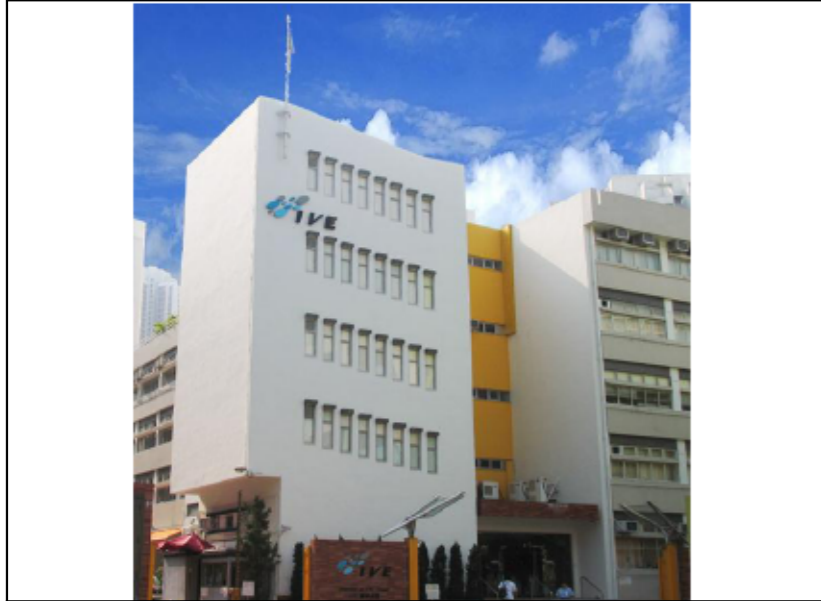
GIC1.11 HONG KONG INSTITUTE OF VOCATION EDUCATION KWUN TONG CAMPUS AND KWUNG TONG GOVERNMENT PRIMARY SCHOOL