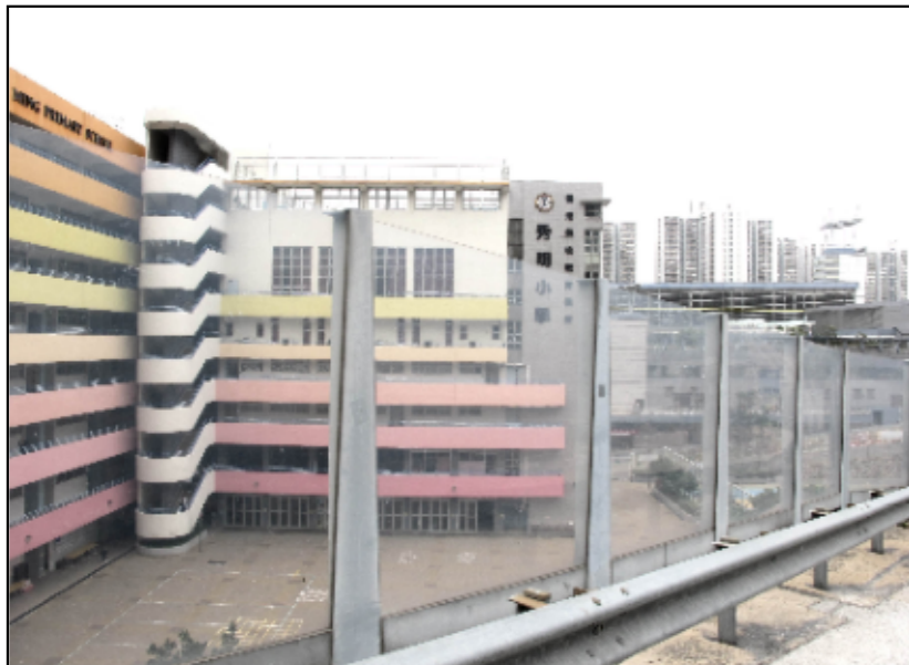
GIC1.12 SAU MING PRIMARY SCHOOL