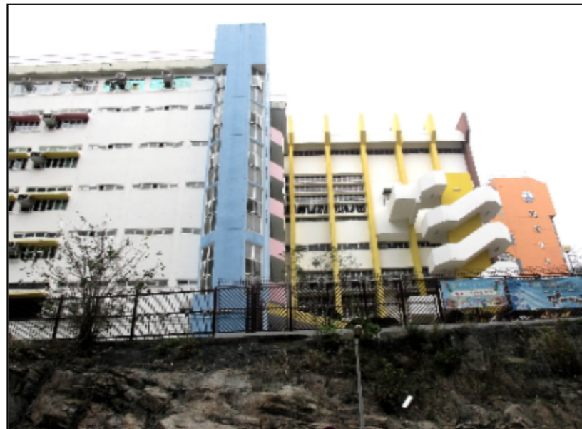
GIC1.15 KWUN TONG GOVERNMENT SECONDARY SCHOOL AND SHUN LEE CATHOLIC SECONDARY SCHOOL