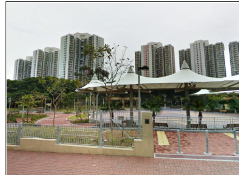
01.3 SAU MING ROAD PARK