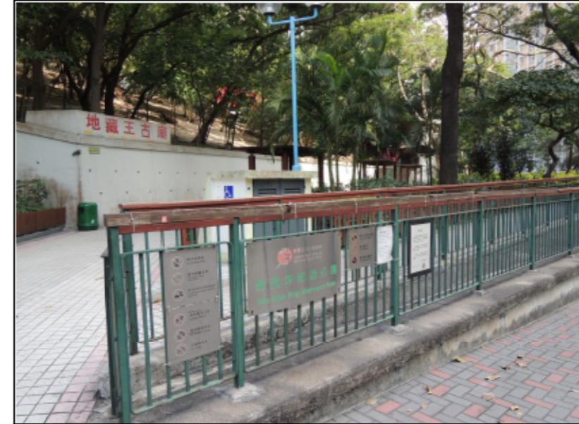
01.2 SAU MAU PING MEMORIAL PARK