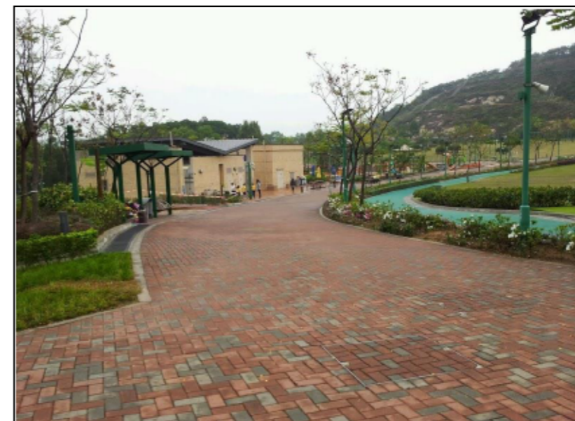
01.4 JORDAN VALLEY PARK