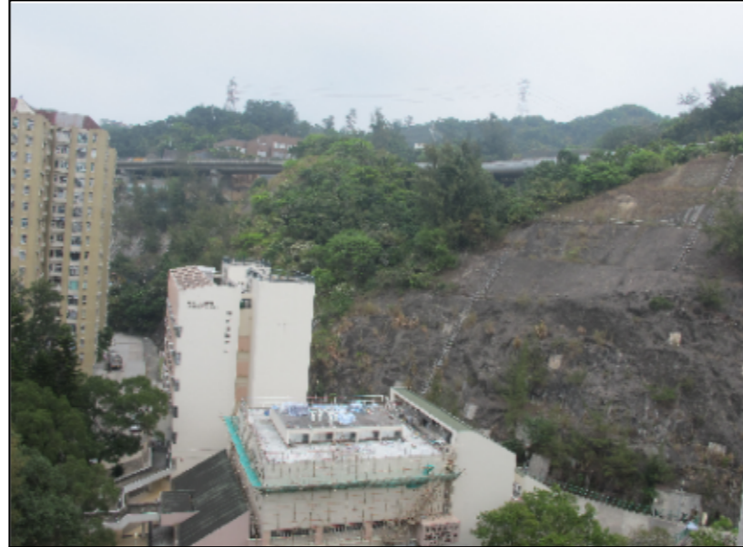
GIC1.14 SHUN LEE ESTATE COMMUNITY CENTRE