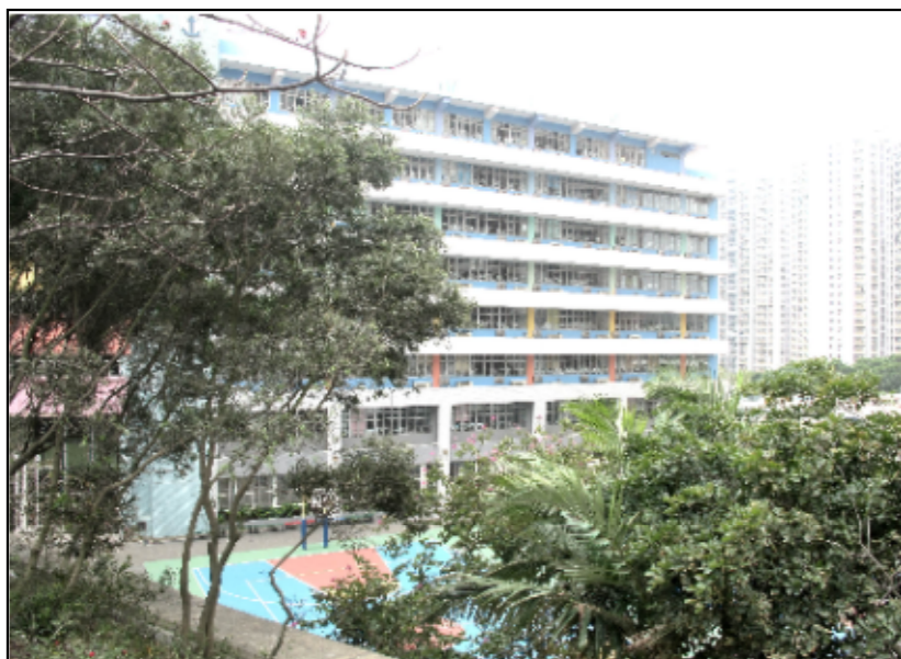
GIC1.13 THE MISSION COVENANT CHURCH HOLM GLAD COLLEGE