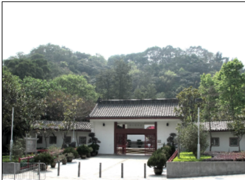
01.6 HONG NING ROAD PARK AND SAU NGA ROAD PLAYGROUND