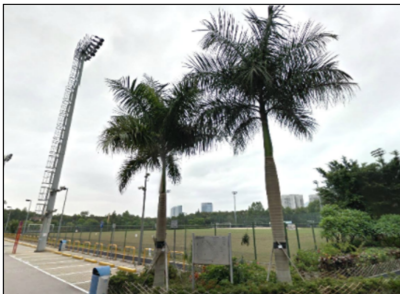
01.7 SAI TSO WAN RECREATION GROUND