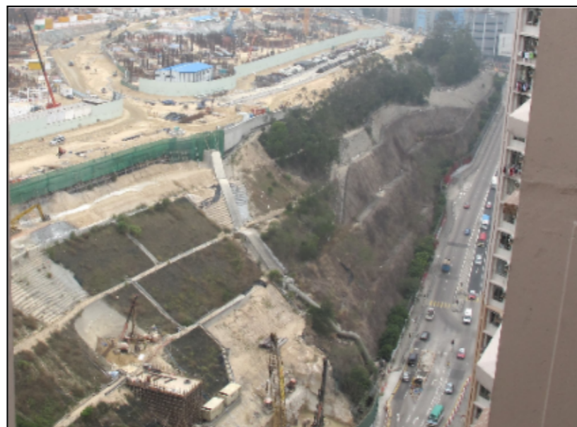
P1.1 PLANNED DEVELOPMENT AT ANDERSON ROAD (DAR)