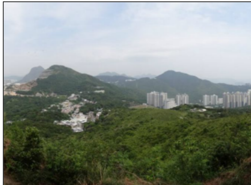
OU1.1 HIKERS AT WILSON TRAIL SECTION 3