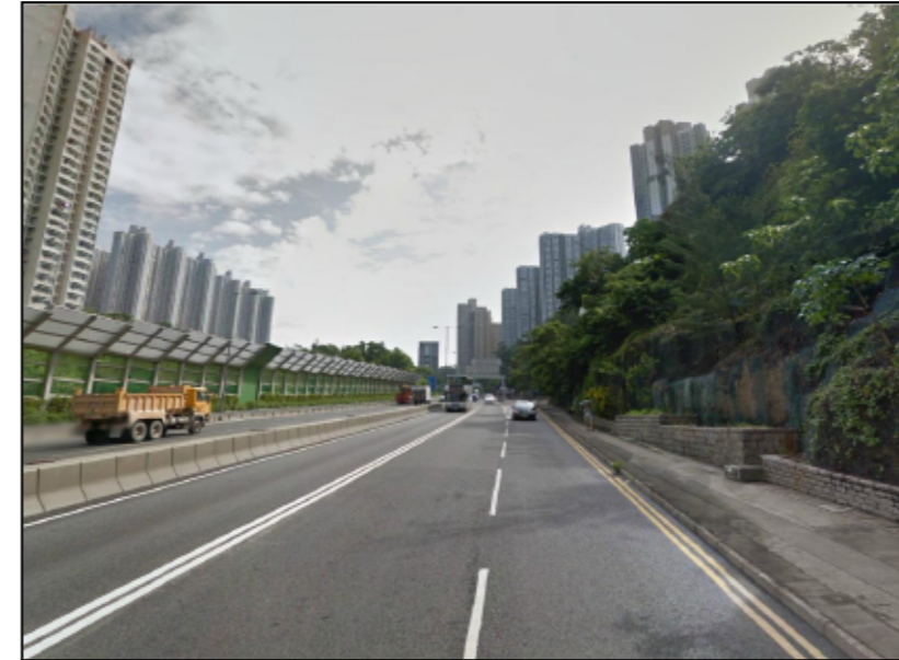
T1.1 TRAVELLER ON TSEUNG KWAN O ROAD