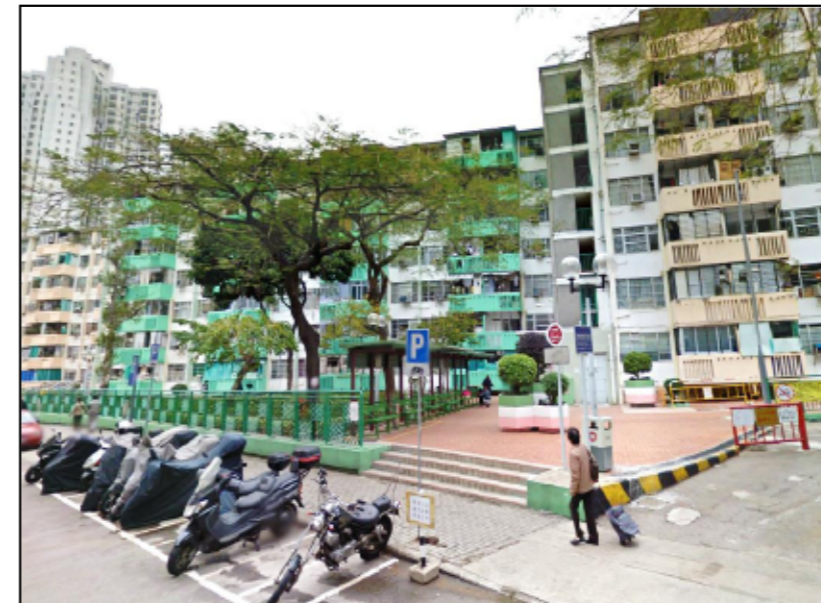
R2.1 WO LOK ESTATE