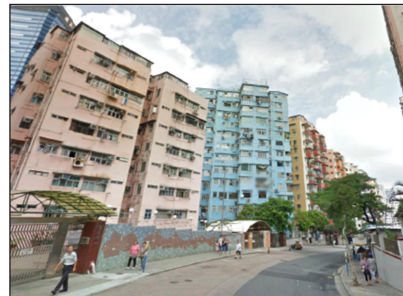
R2.2 MEDIUM RISE RESIDENTIAL BUILDING AT YUET WAH STREET