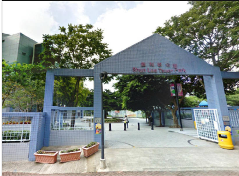
01.5 SHUN LEE ESTATE PARK