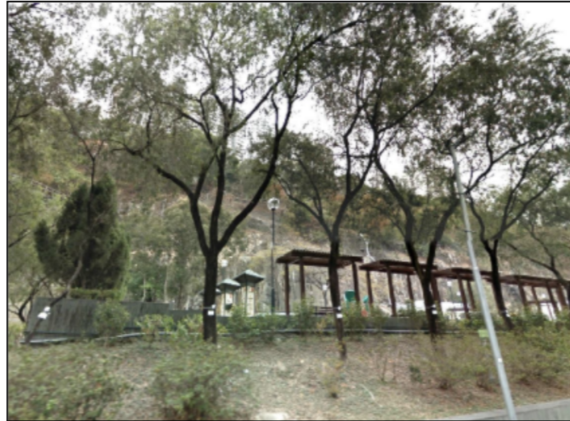
01.8 HIU KWONG STREET RECREATION GROUND AND HIU MING STREET PLAYGROUND