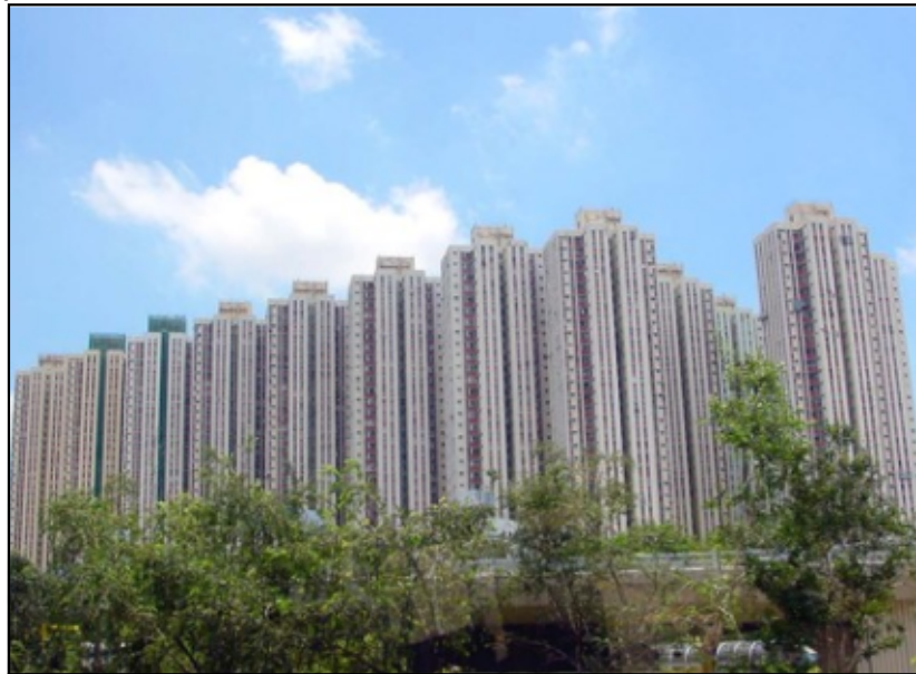
R2.12 RICHLAND GARDEN