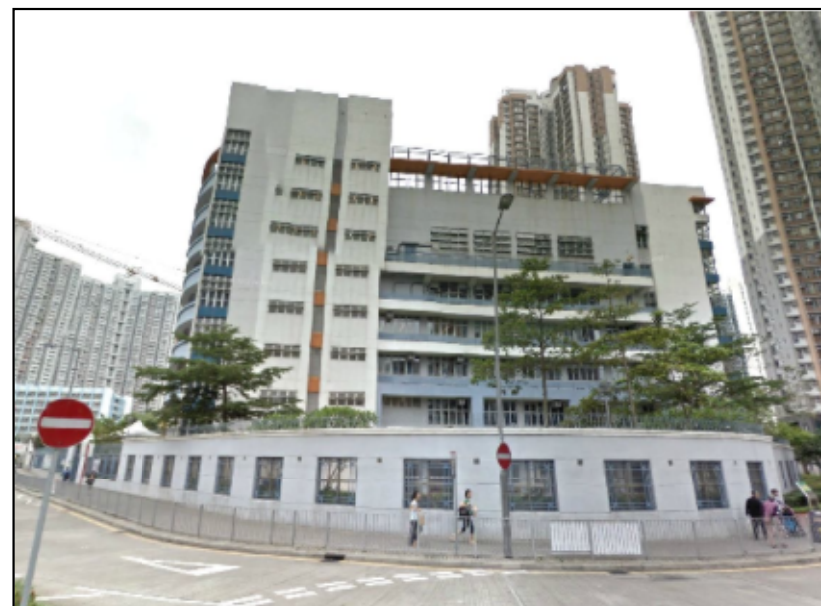
G1C2.4 ST. EDWARD'S CATHOLIC PRIMARY SCHOOL