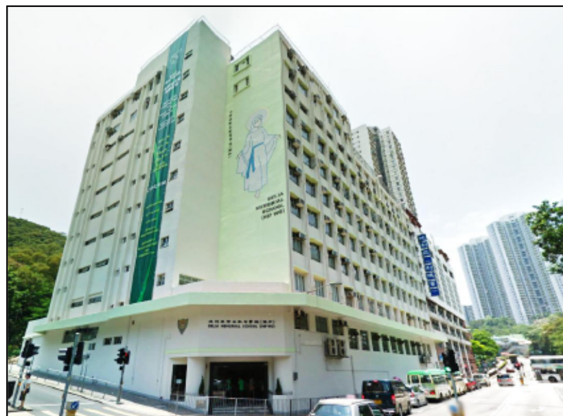
G1C2.1 DELIA MEMORIAL SCHOOL