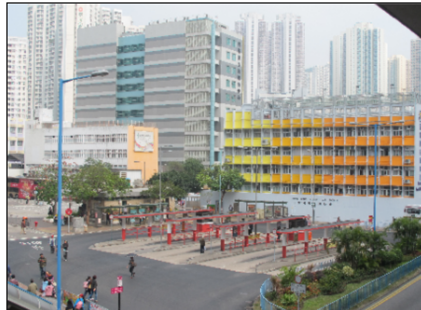
G1C2.3 GOVERNMENT AND COMMUNITY OFFICES ALONG TSUI PING ROAD