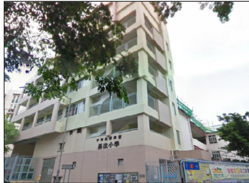
G1C2.2 THE CHURCH OF CHRIST IN CHINA KEI FAAT PRIMARY SCHOOL