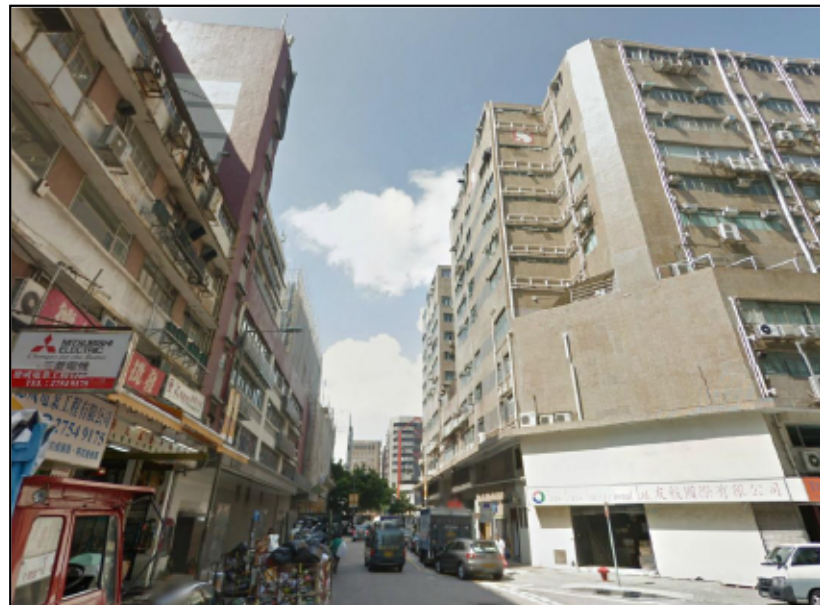
C12.2 MIX USE OF COMMERCIALS AND INDUSTRIALS AT KOWLOON BAY INDUSTRIAL ZONE