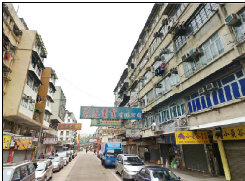
RC2.2 RESIDENTIAL AND COMMERCIAL DEVELOPMENTS IN KOWLOON CITY