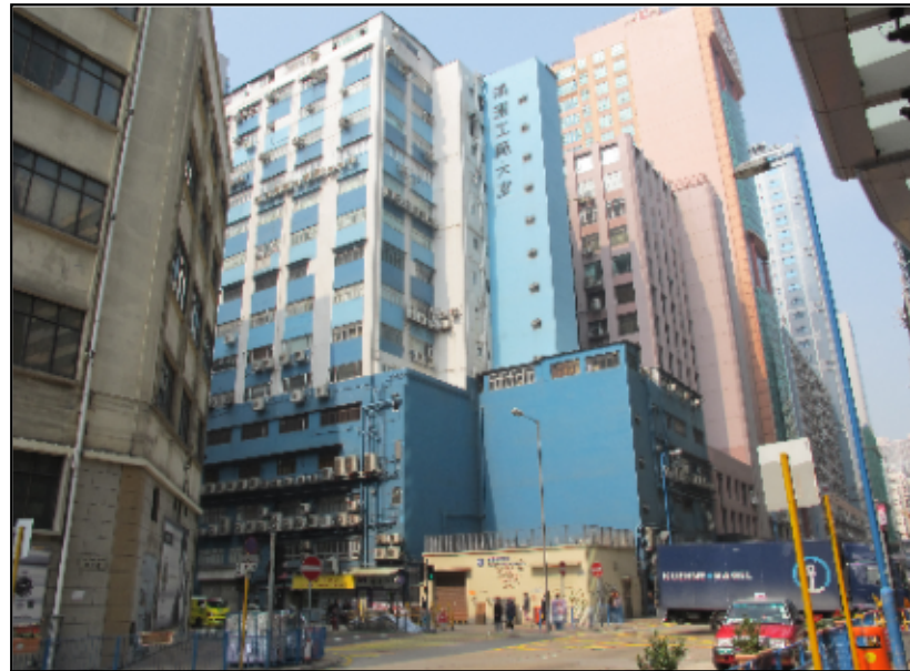
C12.1 COMMERCIAL AND INDUSTRIAL DEVELOPMENTS IN KWUN TONG BUSINESS AREA