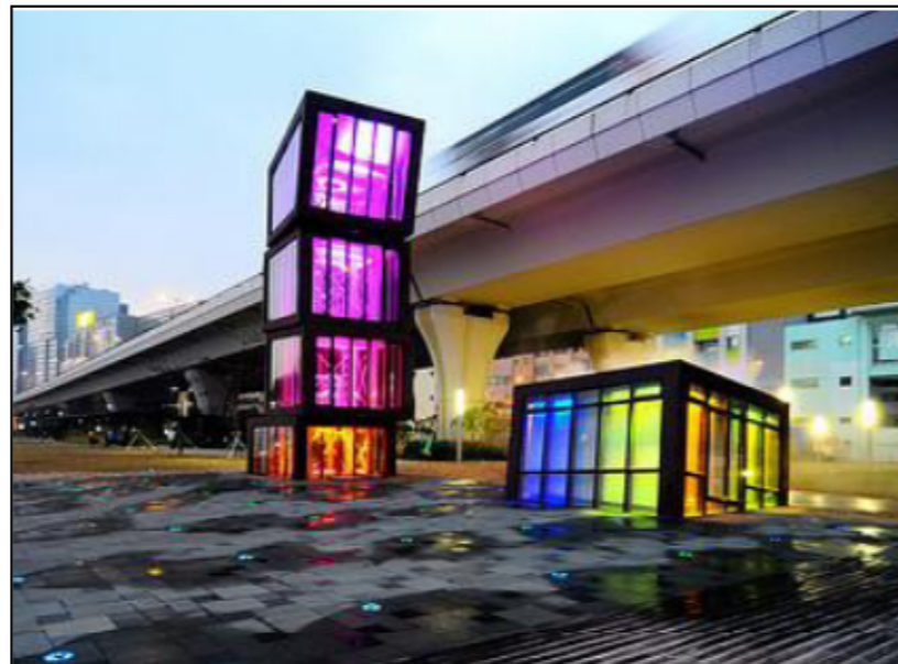
02.5 KWUN TONG PROMENADE