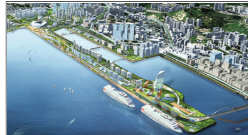
P2.1 PLANNED RESIDENTIAL, COMMERCIAL DEVELOPMENTS AT KAI TAK CITY CENTRE AND VISITORS OF KAI TAK RIVER P2.2 PLANNED CRUISE TERMINAL AND RUNWAY PARK P2.3 PLANNED METRO PARK P2.4 PLANNED KAI TAK MULTI-PURPOSE STADIUM COMPLEX