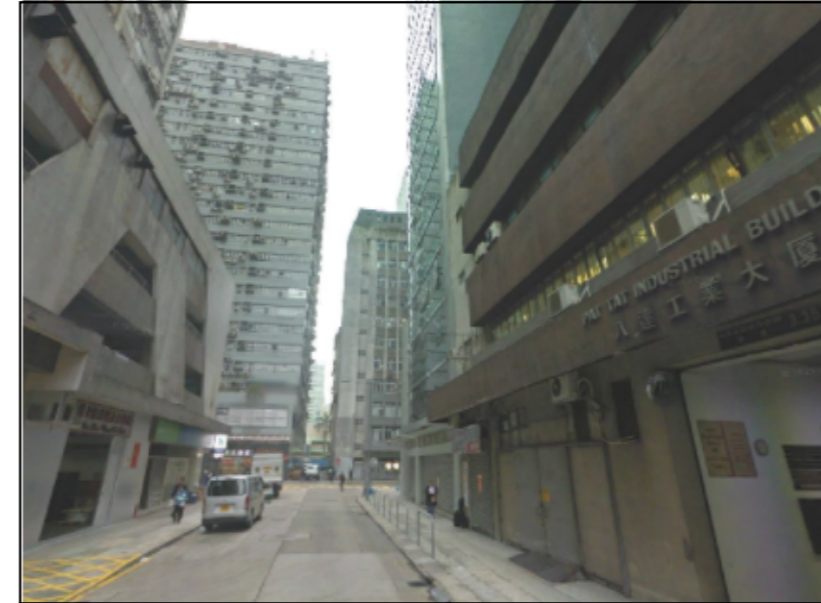
OU2.2 COMMERCIAL AND INDUSTRIAL AT SAN PO KONG INDUSTRIAL ZONE