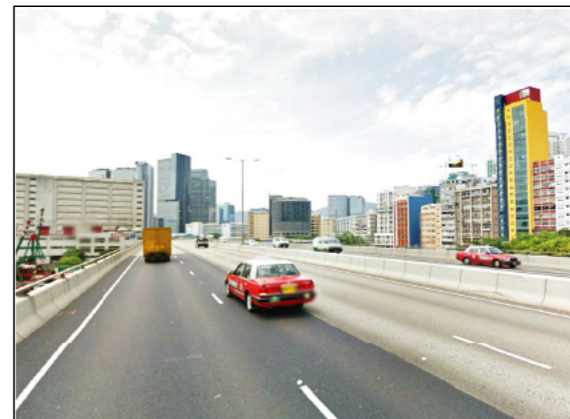
T2.2 TRAVELLER ON KWUN TONG BYPASS