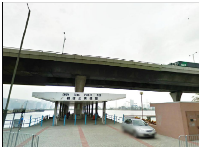
OU2.1 KWUN TONG FERRY PIER