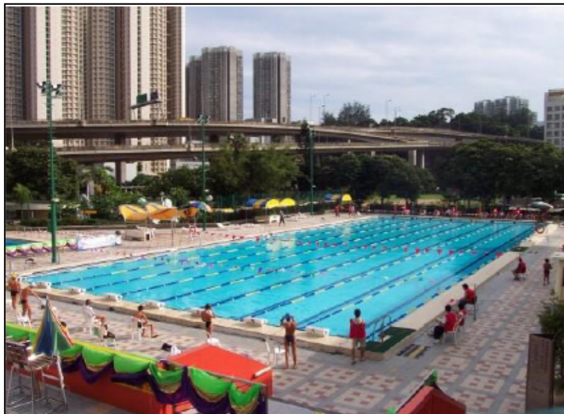
02.2 KWUN TONG SWIMMING POOL