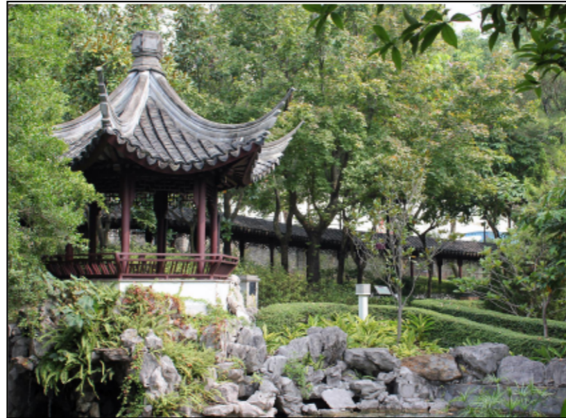
02.4 KOWLOON WALLED CITY PARK