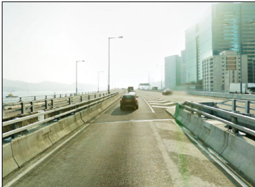
T5.1 TRAVELLERS ON ISLAND EAST CORRIDOR