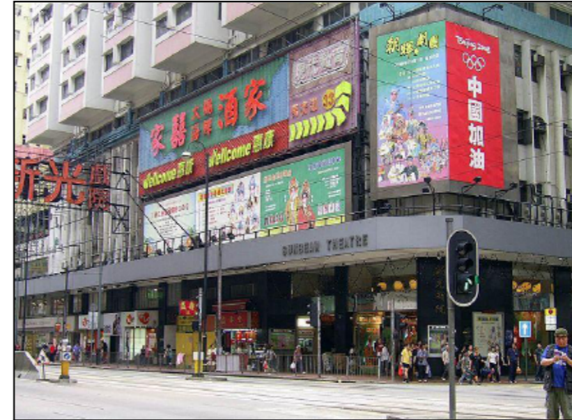
RC6.1 RESIDENTIAL AND COMMERCIALS DEVELOPMENTS AT NORTH POINT