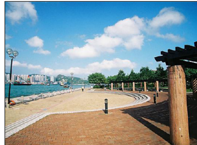
06.1 QUARRY BAY PARK