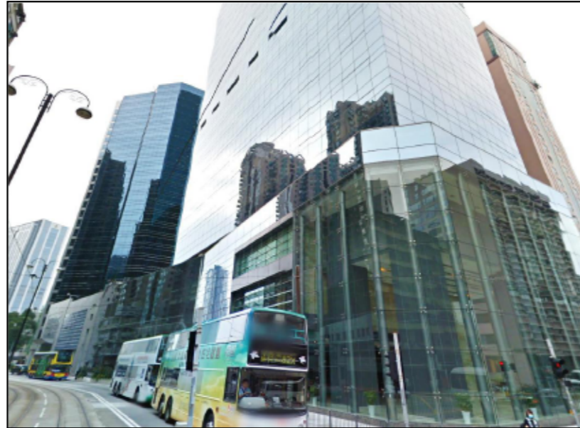
R6.1 TAI KOO SHING