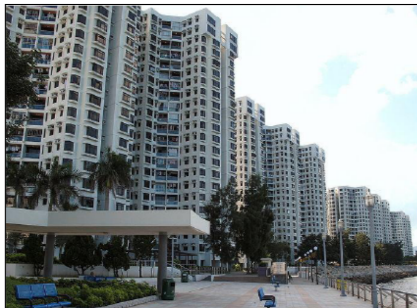
R6.3 HENG FA CHUEN