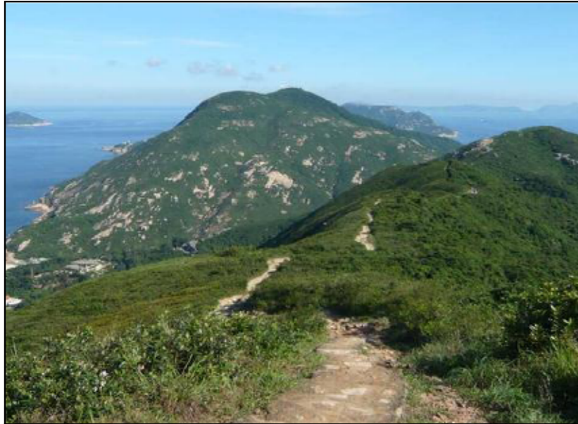
OU5.4 HIKERS ON HONG KONG TRAIL SECTION 3