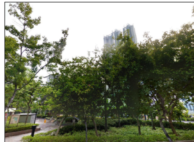
06.2 SAI WAN HO PLAYGROUND