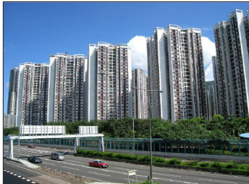
R6.2 RESIDENTS AT SAI WAN HO WATERFRONT