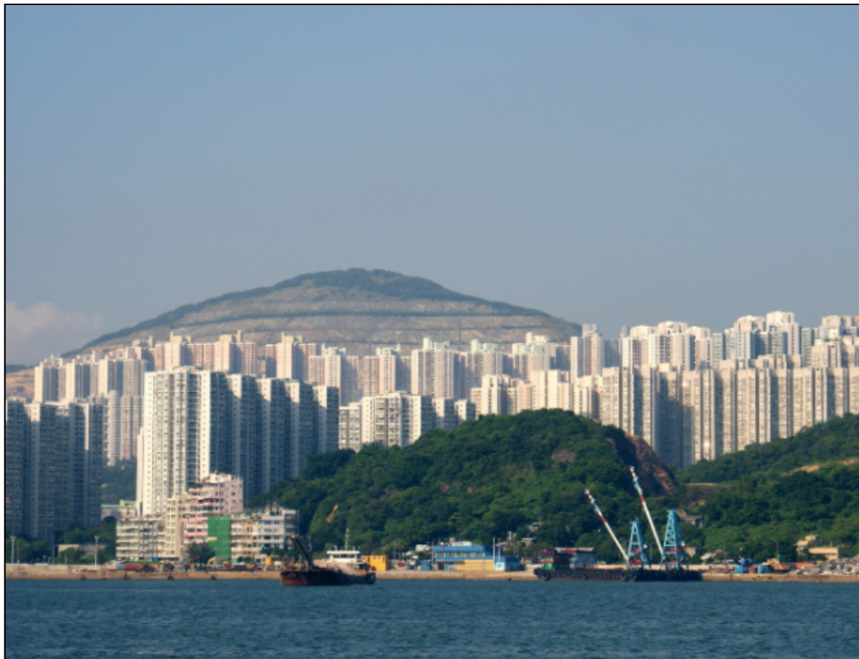
S4 - VIEWING FROM O6.3 (ALDRICH BAY PARK AND PROMENADE)