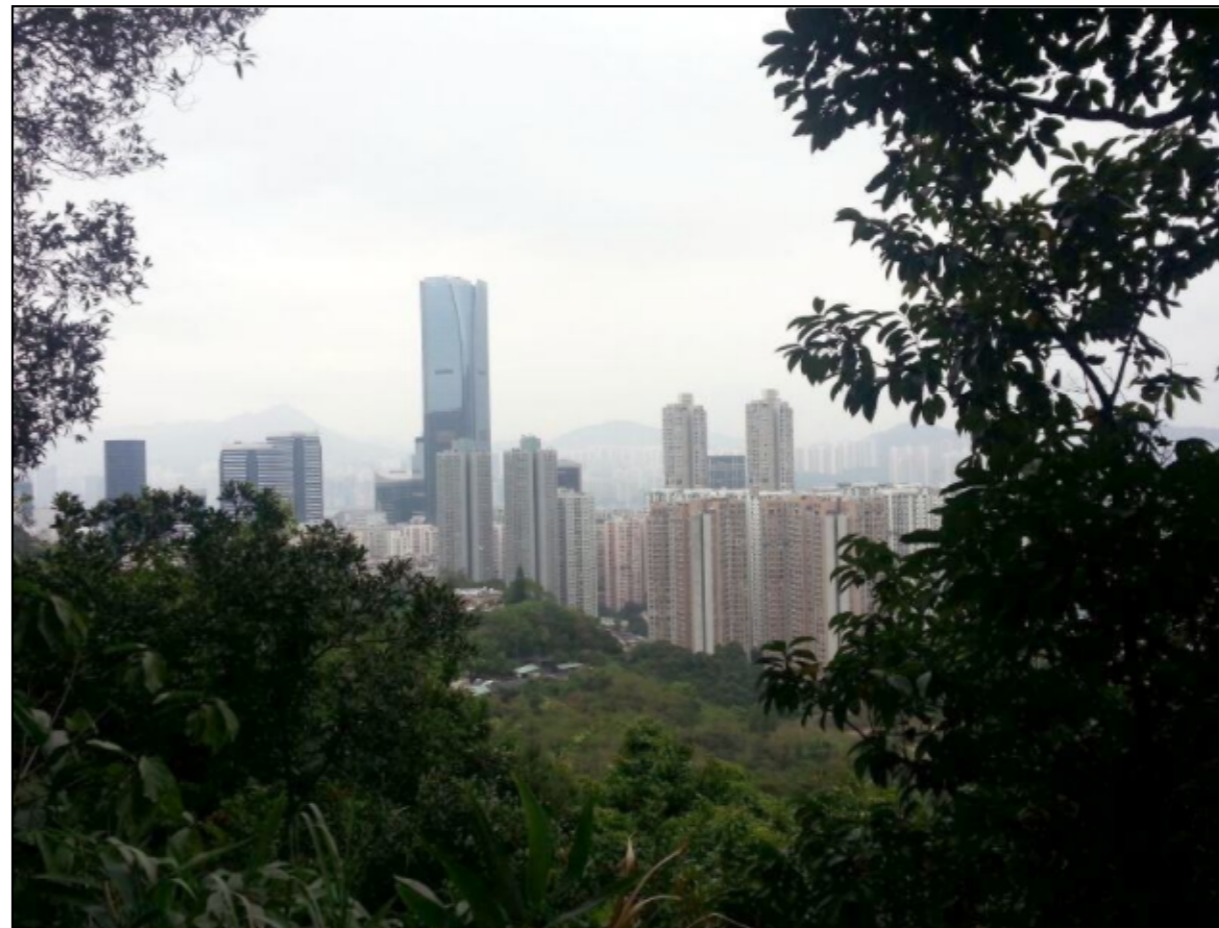
S5 - VIEWING FROM OU6.2 (HIKERS AT MT BUTLER AND MT PARKER)