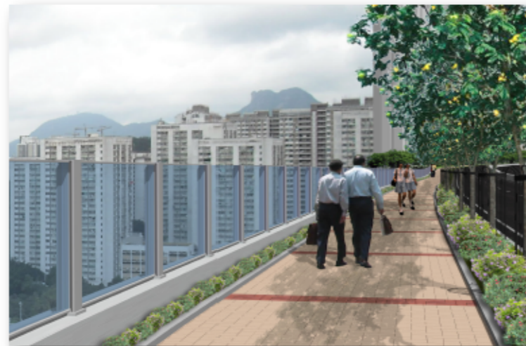
Proposed aesthetic pavement pattern at adjacent DAR area OM3, OM5

Key dimensions and materials choices are subject to detail design stage