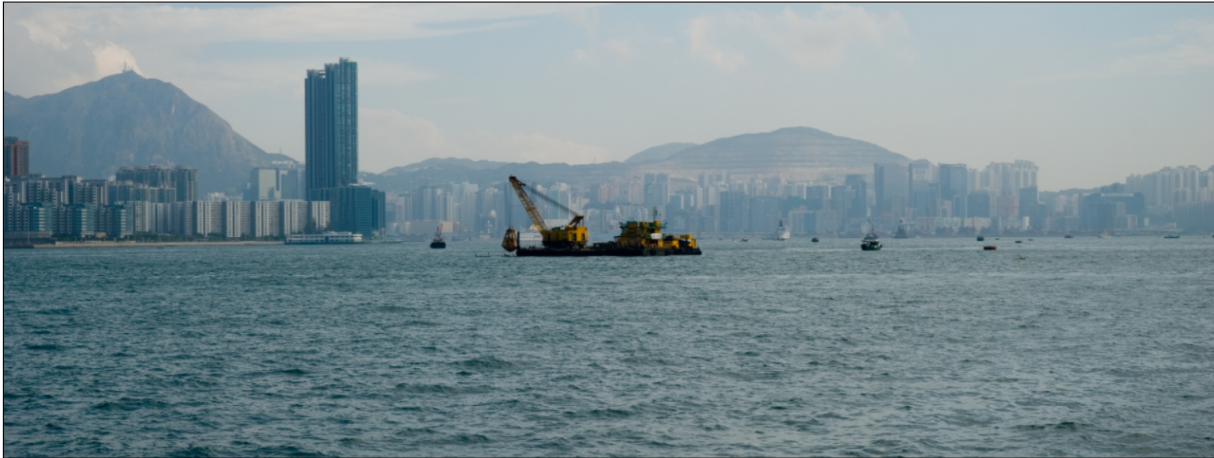
EXISTING CONDITION SVP3 FROM HONG KONG CONVENTION AND EXHIBITION CENTRE (C5.1)