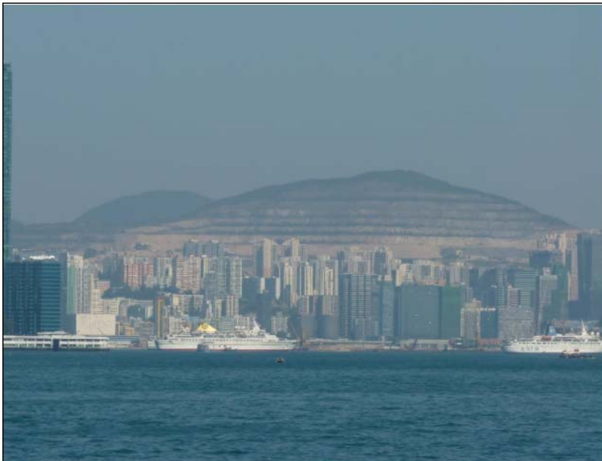
EXISTING CONDITION DVP3 FROM TRAVELLER ON VICTORIA HARBOUR (T4.1)