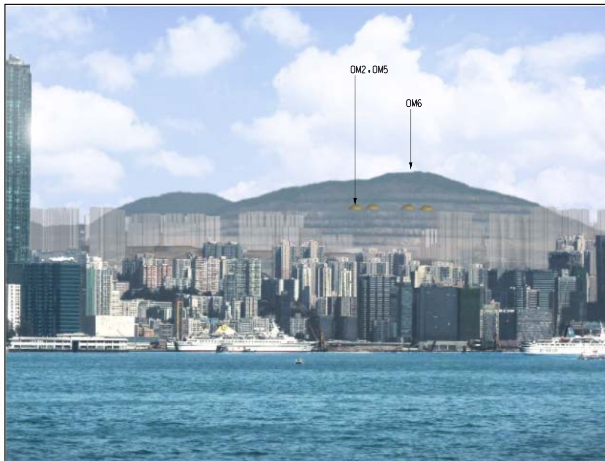
YEAR 10 WITH MITIGATION MEASURES