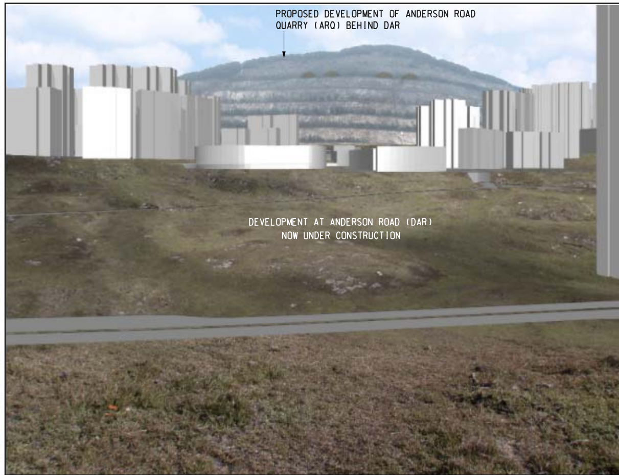
DAY 1 WITHOUT MITIGATION MEASURES