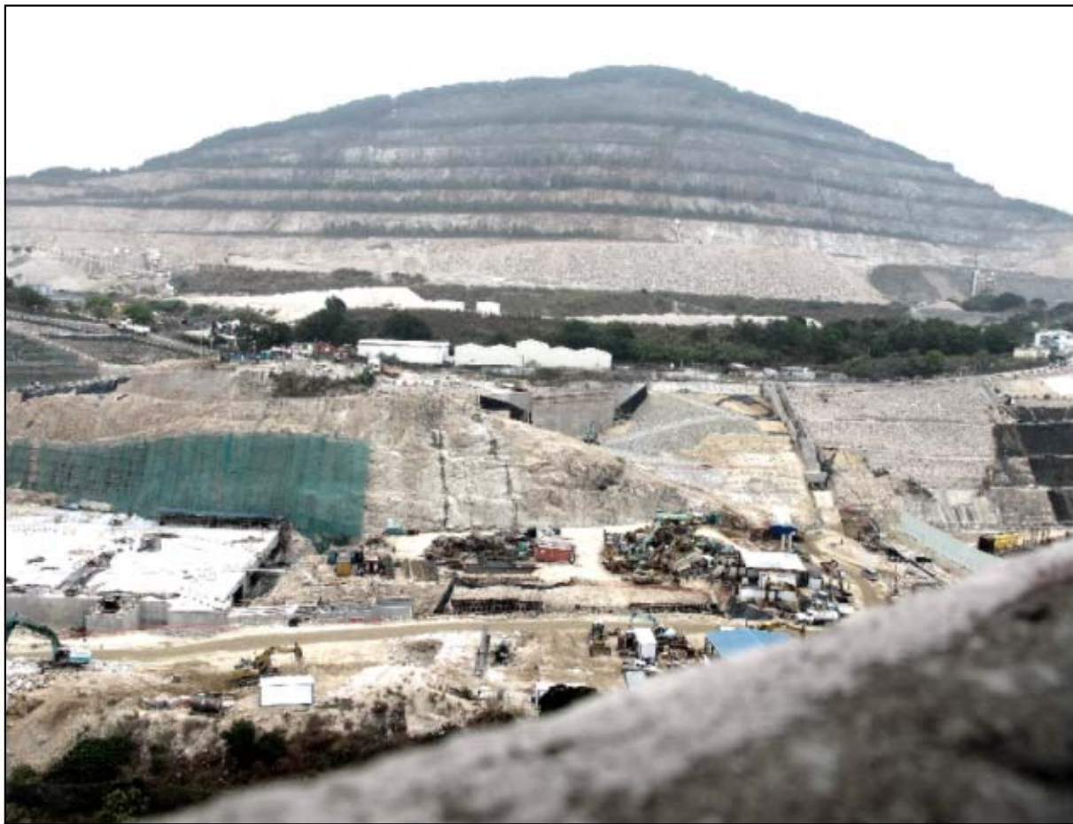
EXISTING CONDITION LVP2 FROM SAU MAU PING ESTATE, SAU HONG HOUSE (R1.1)