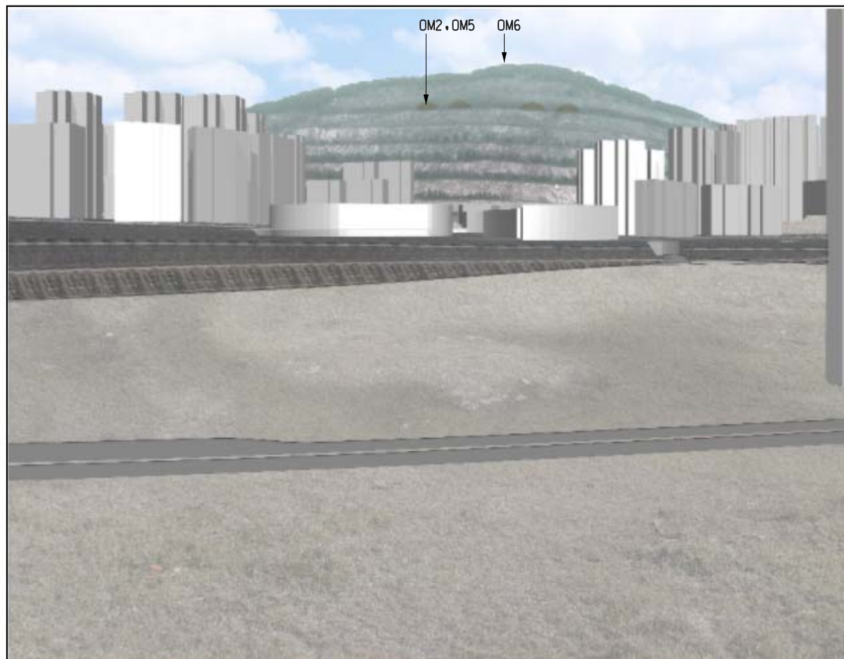
YEAR 10 WITH MITIGATION MEASURES