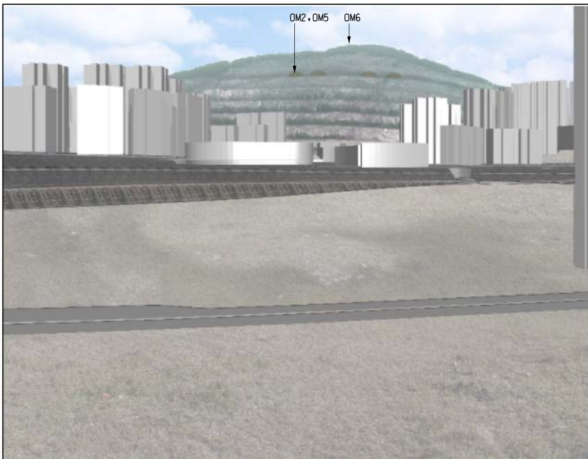
DAY 1 WITH MITIGATION MEASURES