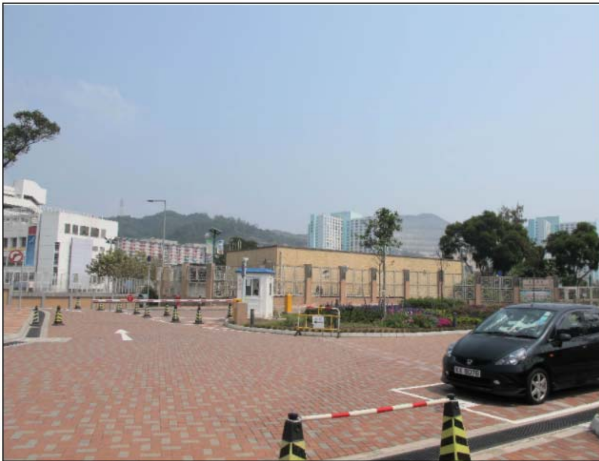
EXISTING CONDITION LVP6 FROM JORDAN VALLEY PARK, PARK NORTHERN ENTRANCE (O1.4)