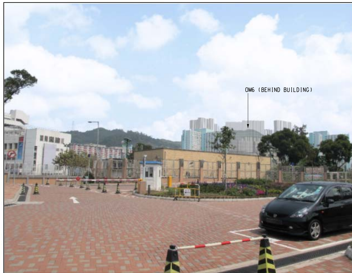
YEAR 10 WITH MITIGATION MEASURES