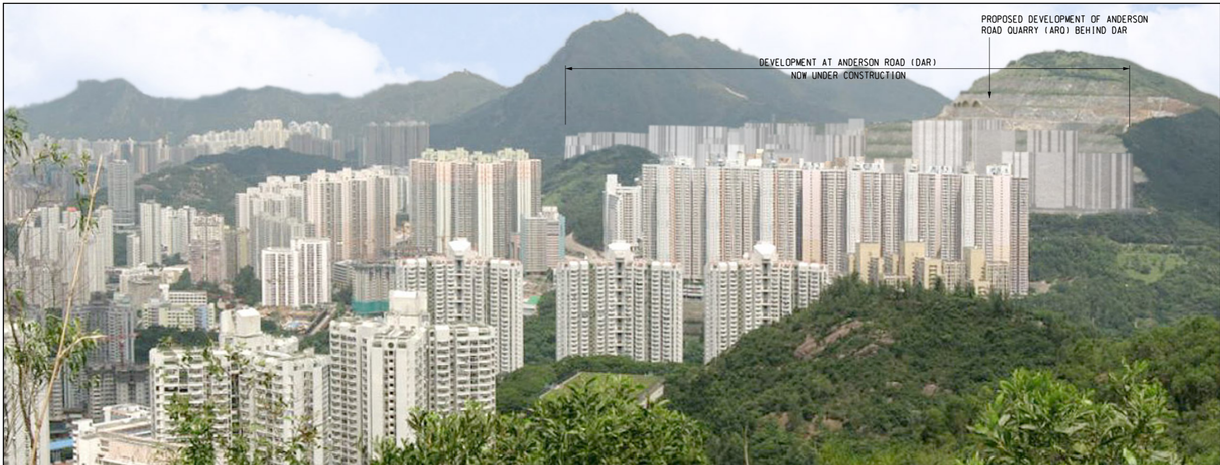
DAY 1 WITHOUT MITIGATION MEASURES