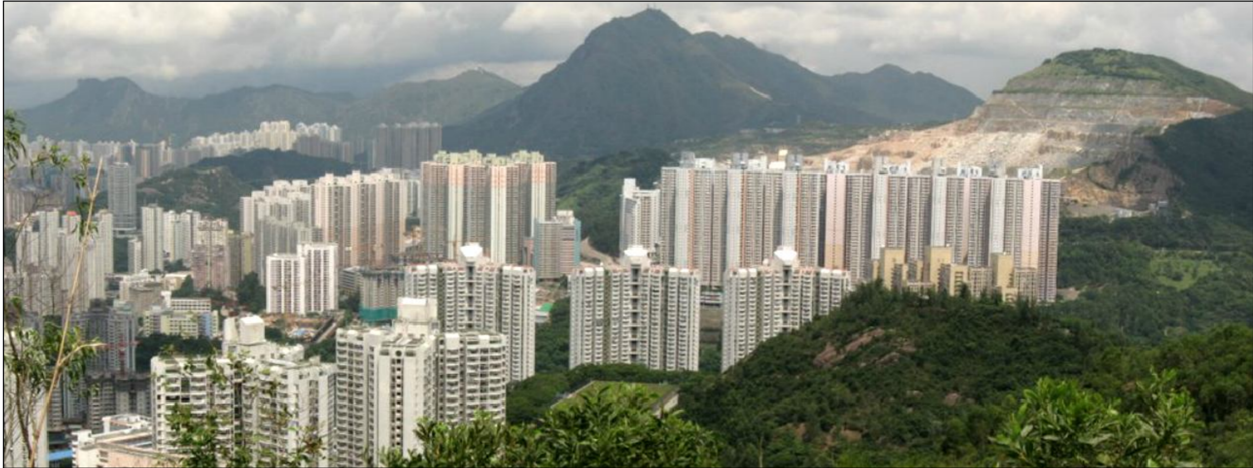
EXISTING CONDITION LVP8 FROM WILSON TRAILS STAGE 3, BLACK HILL (OU1.1)