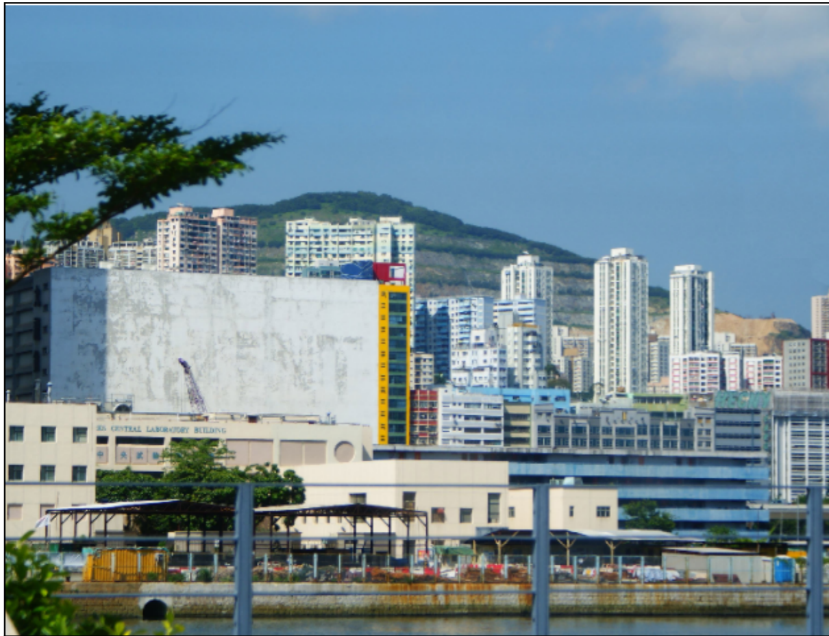
EXISTING CONDITION LVP10 FROM PLANNED LANDSCAPE WALKWAY ALONG KAI TAK WATERFRONT