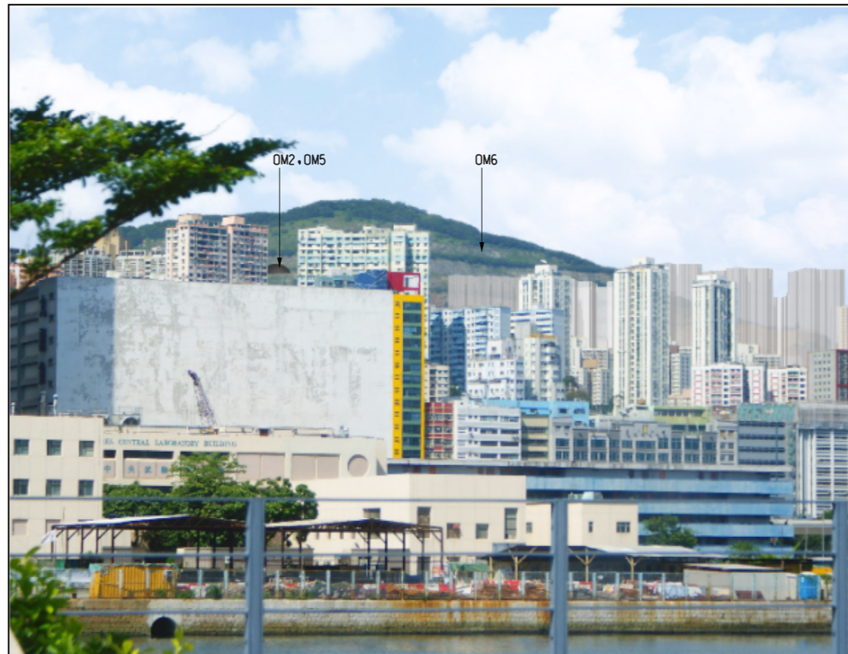
YEAR 10 WITH MITIGATION MEASURES