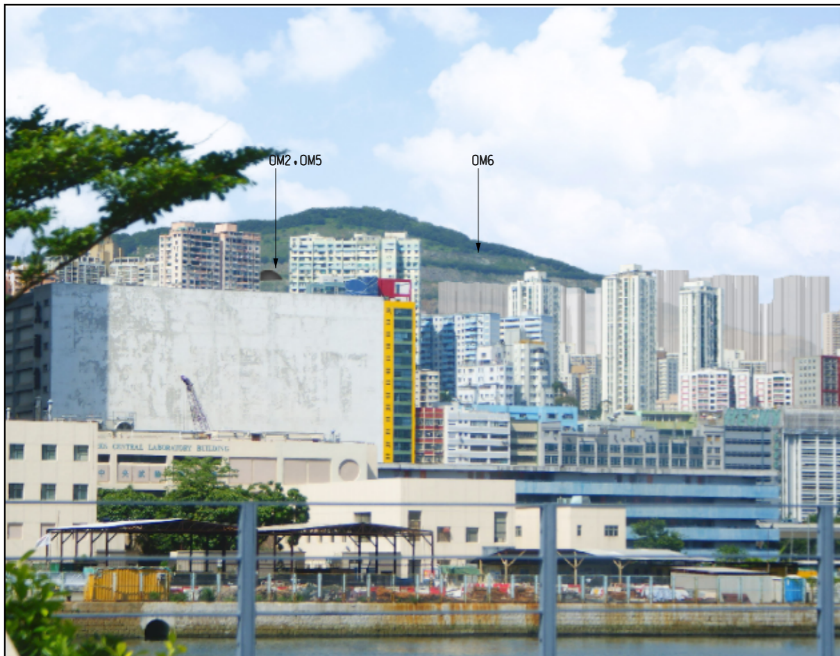
DAY 1 WITH MITIGATION MEASURES