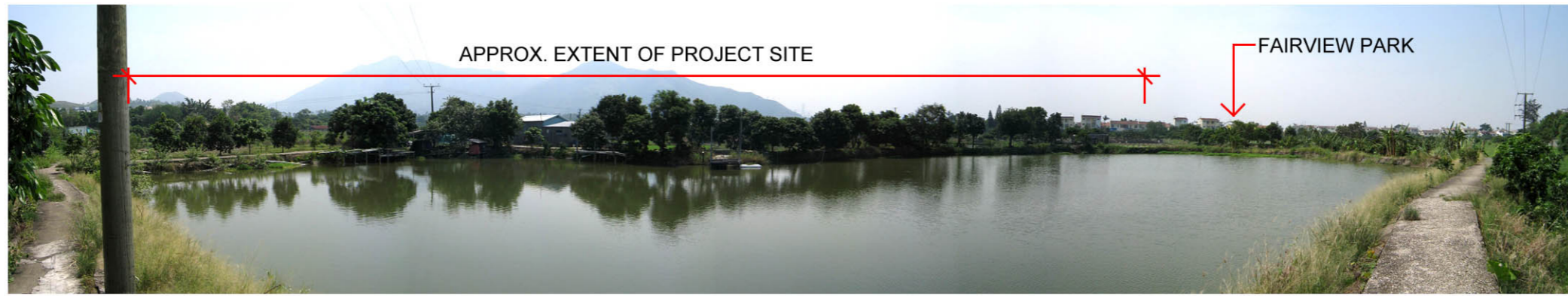
VIEW FROM VSR R2 SOUTHERN PALM SPRINGS - EXISTING SITUATION (VIEW POINT 10)