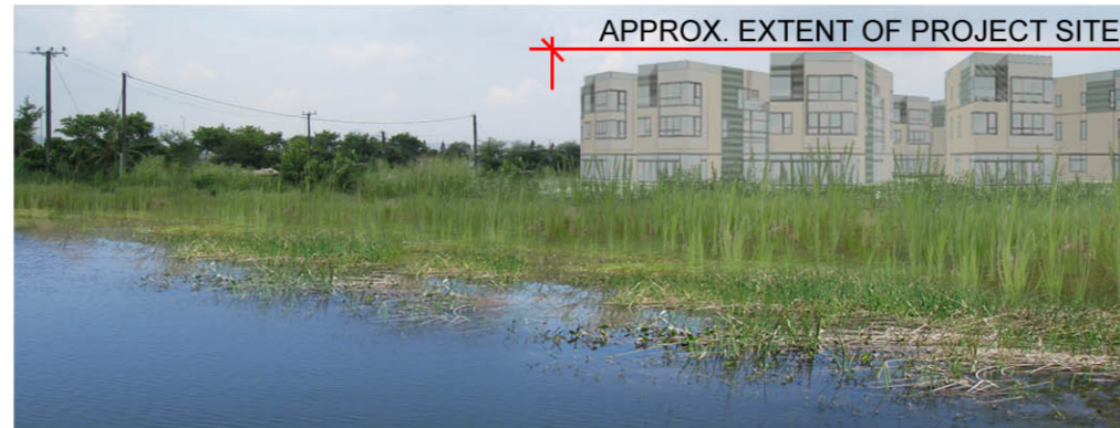
VIEW FROM VSR R4 SOUTH-WESTERN YAU MEI SAN TSUEN - DAY 1 WITHOUT MITIGATION (VIEW POINT 13)