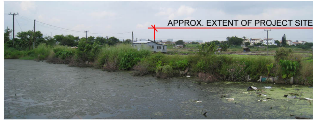
VIEW FROM VSR R4 SOUTH-WESTERN YAU MEI SAN TSUEN - EXISTING SITUATION (VIEW POINT 13)