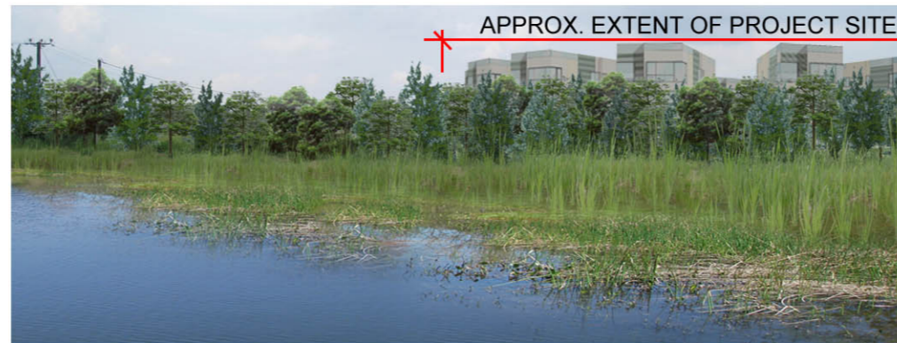
VIEW FROM VSR R4 SOUTH-WESTERN YAU MEI SAN TSUEN - DAY 1 WITH MITIGATION (VIEW POINT 13)