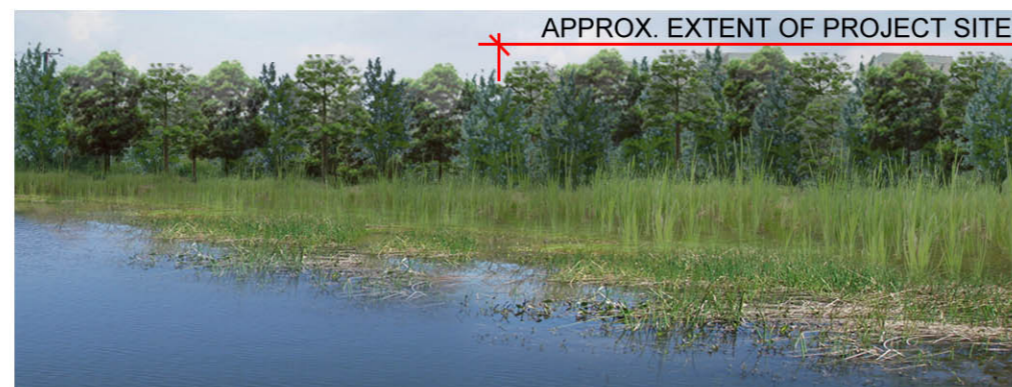
VIEW FROM VSR R4 SOUTH-WESTERN YAU MEI SAN TSUEN - YEAR 10 WITH MITIGATION (VIEW POINT 13)