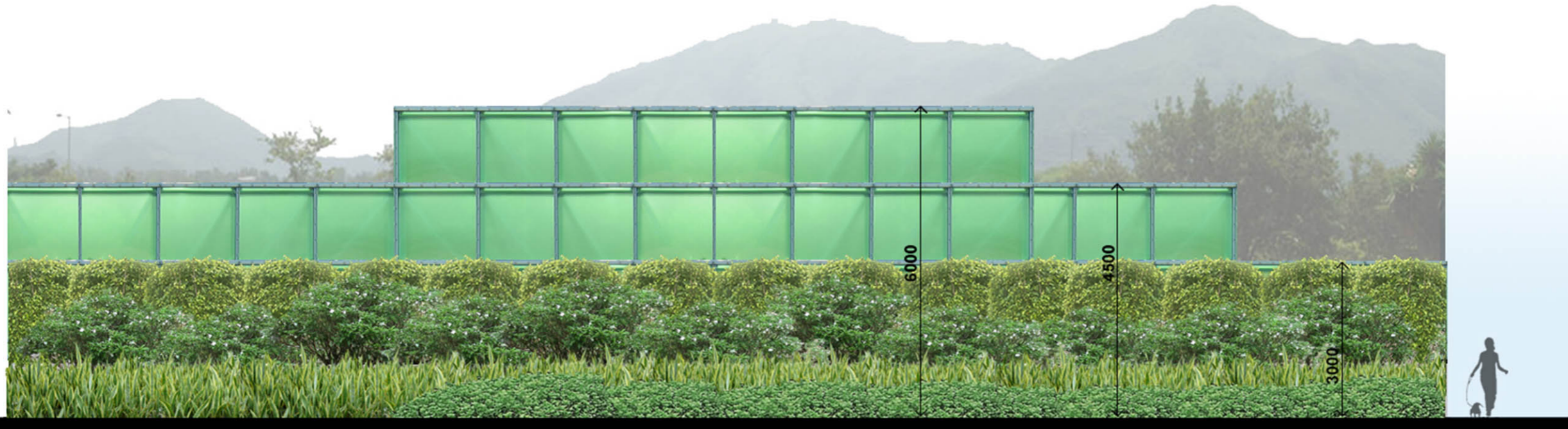
ELEVATION OF NOISE BARRIER LANDSCAPE TREATMENT