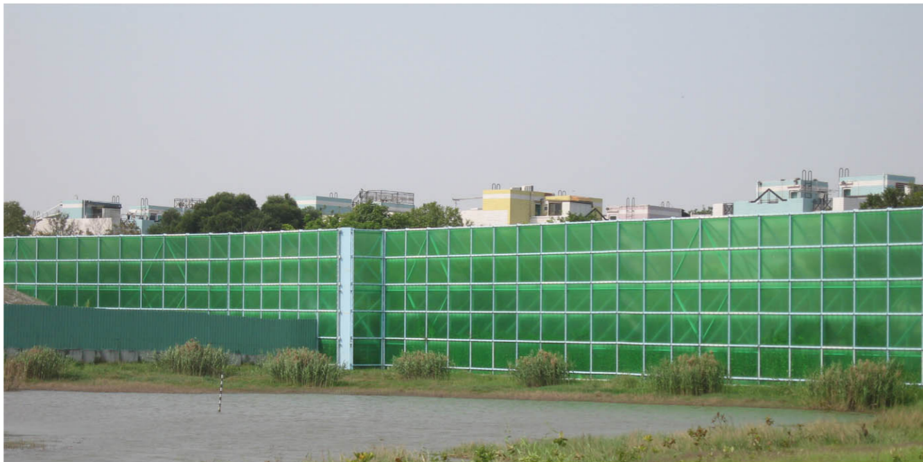
REFERENCE OF EXISTING TEMPORARY NOISE BARRIER AT NAM SANG WAI PROJECT