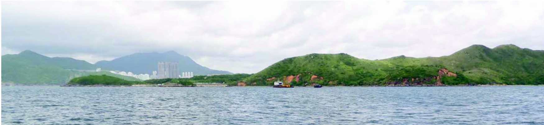
VP5 - Existing View from the sea of Joss House Bay