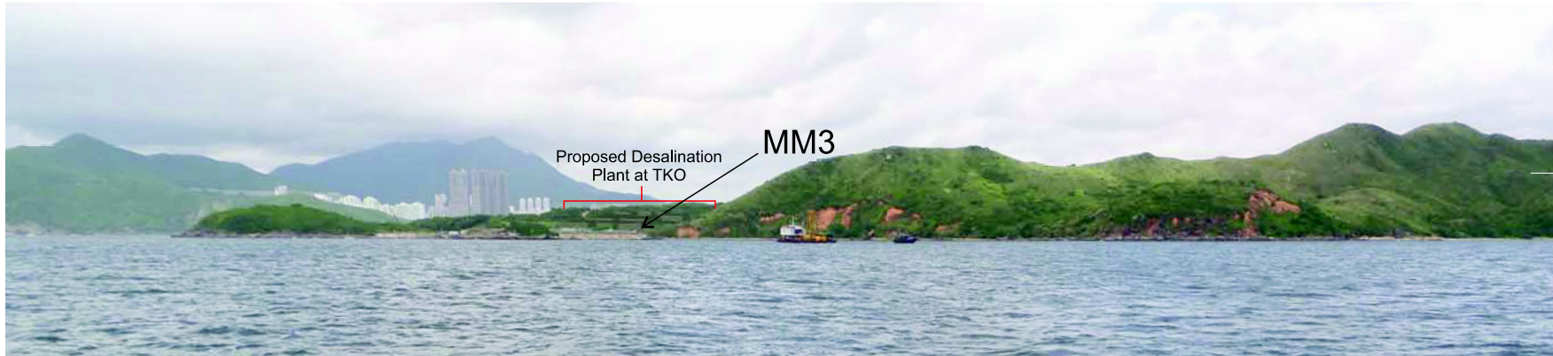
VP5 -View from the sea of Joss House Bay on day 1 operation (with mitigation)