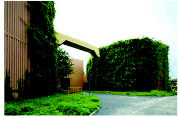
Typical Green Roof and Vertical Greening

*Remark: The rooftops without greening are reserved for installation of equipment. Typical equipment is showed below.