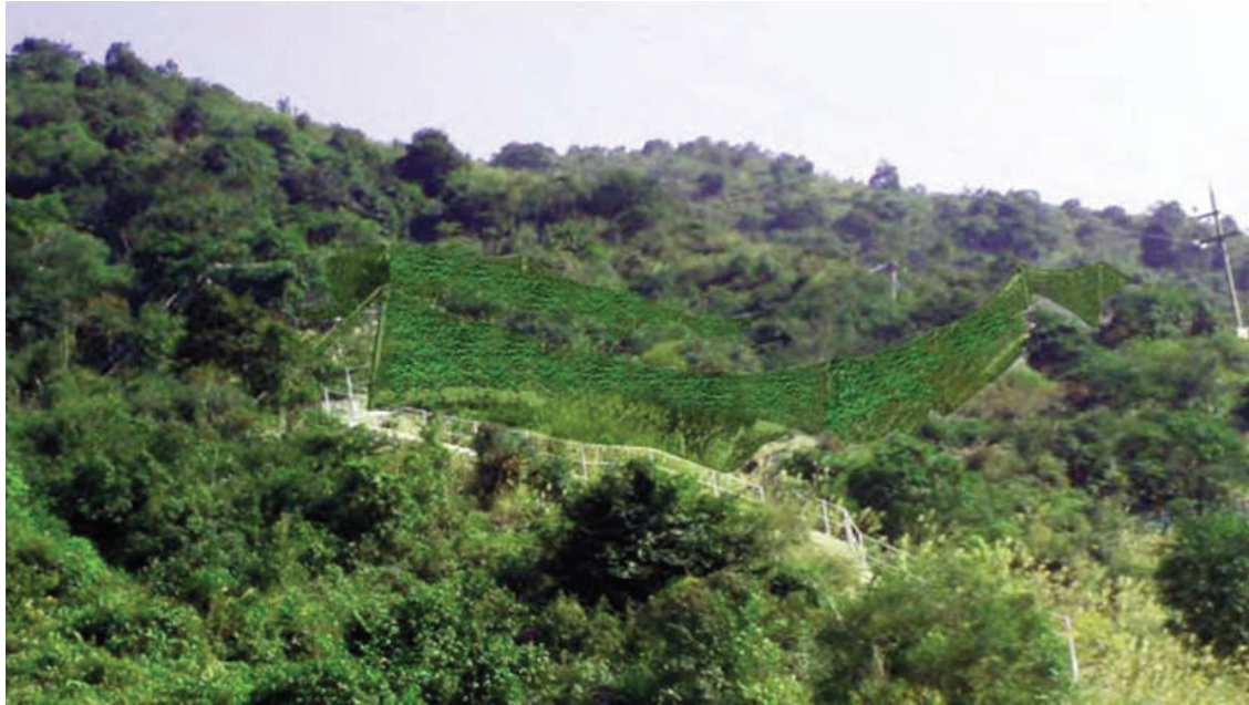
Finished View of Flexible Barrier