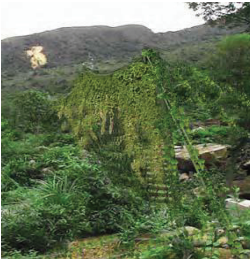
Close-up View of Anchorage