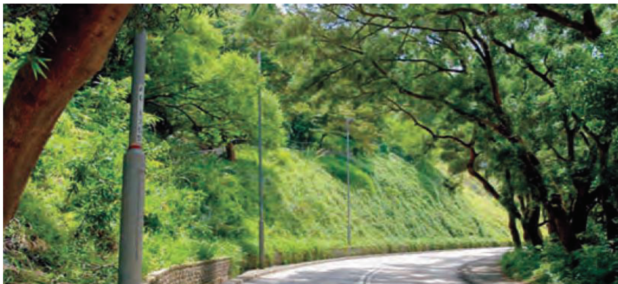
Finished View of Slope Planting