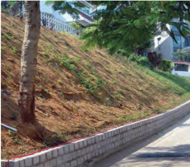
Slope Before Planting