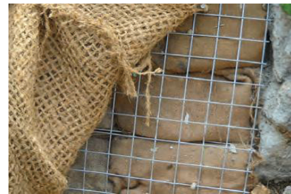
Recessed soil nail head with soil bags