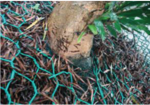
Wire mesh cut to allow tree to grow