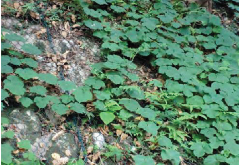
Undergrowth established through wire mesh