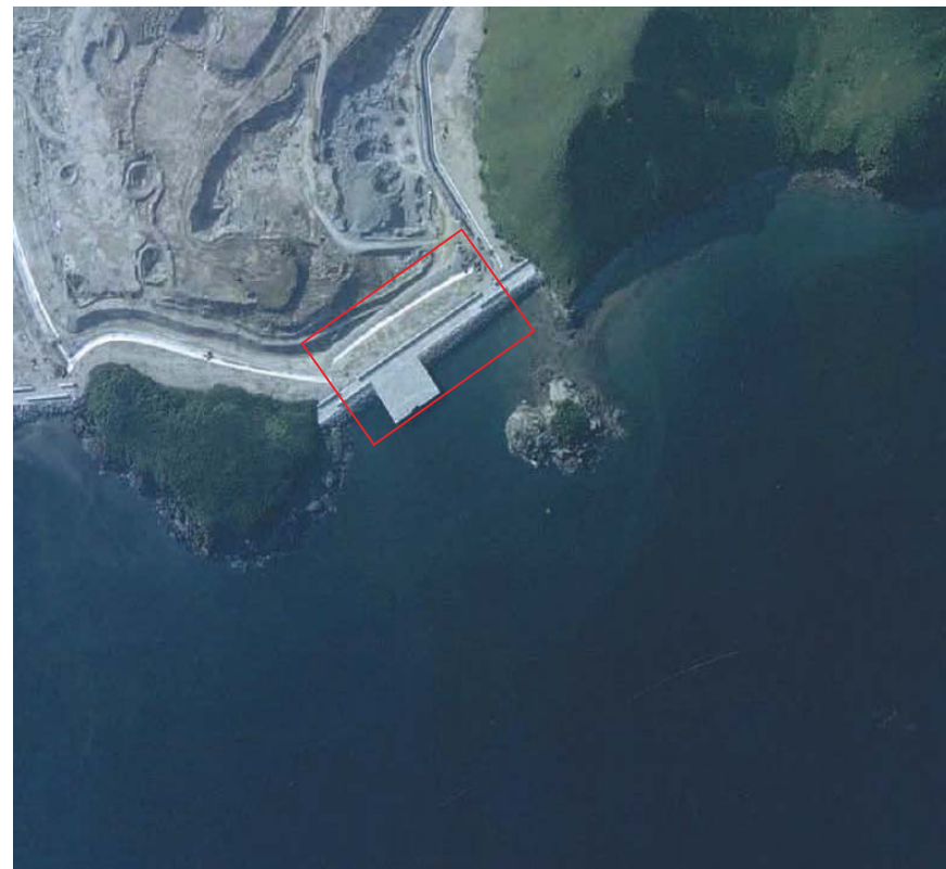
Year 2000 (ref: CN27340, height: 4,000ft) — The reclamation work already extended to cover the TMS Site. TMS Site was vacant and surrounded by construction work of road networks. A concrete jetty was observed.